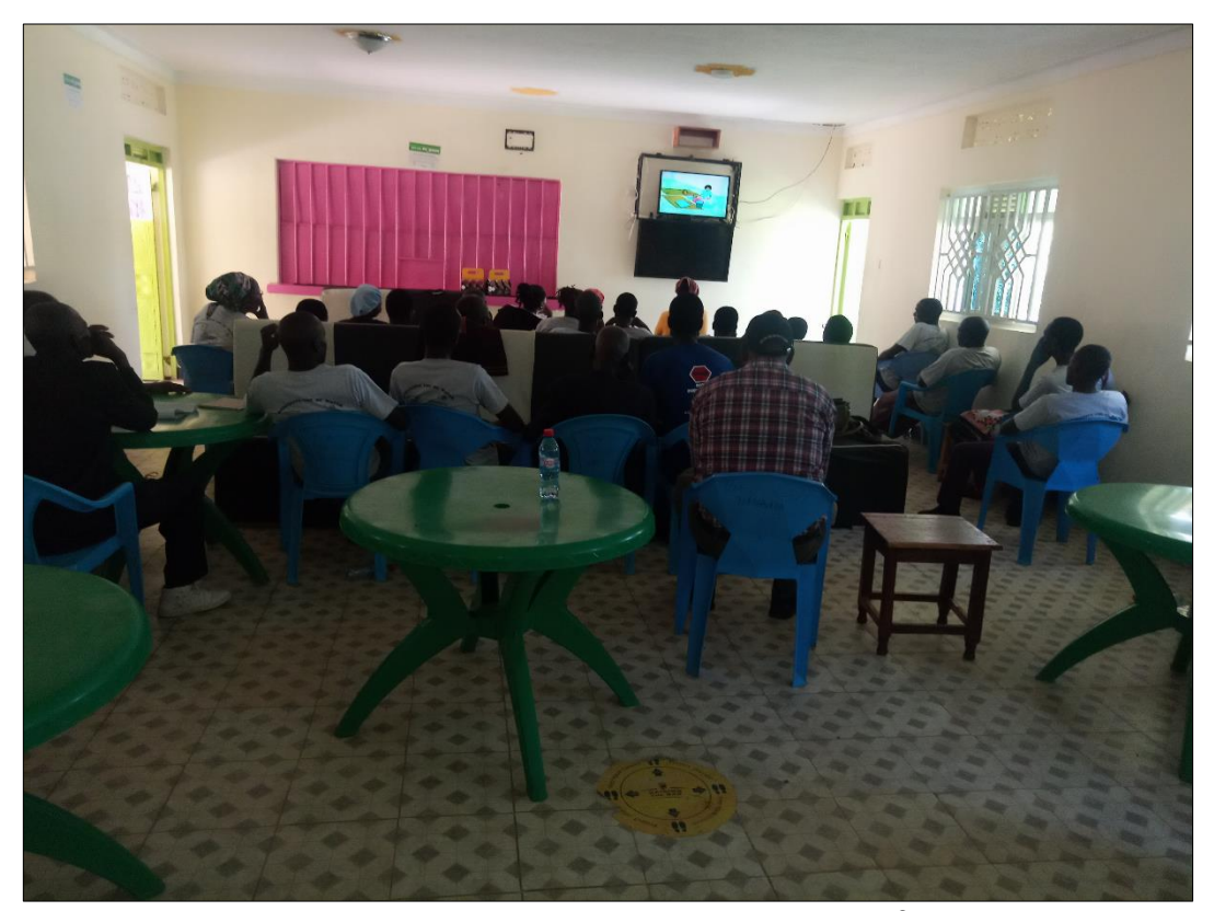
7.0 Participants watching documentary videos on prescription for health and productive use of water