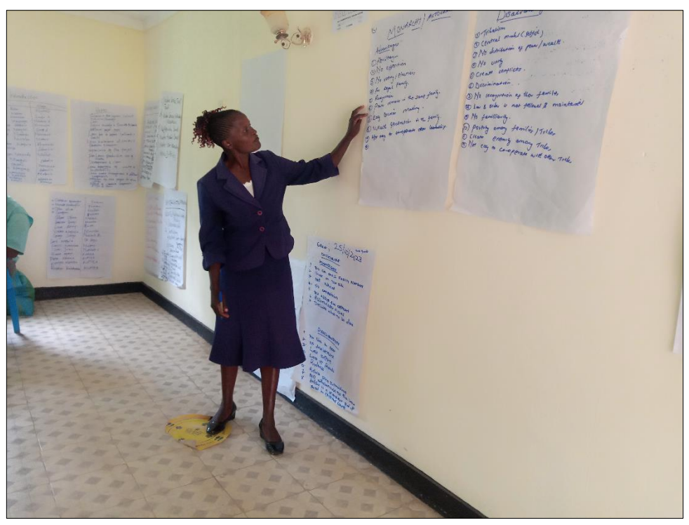
1.0 Participants making presentations on Leadership Styles and qualities