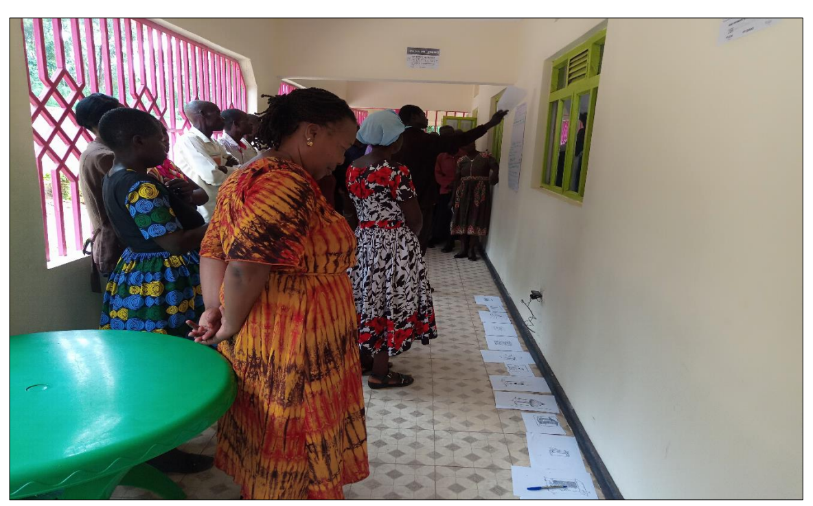
4.0 Group discussions on Sanitation ladders & sanitation improvement