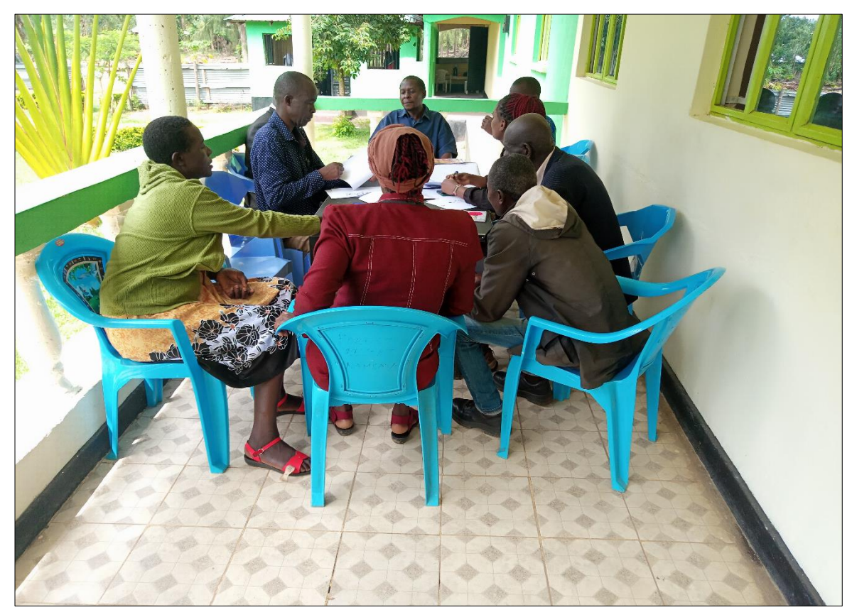
3.0 Group discussions on Gender task analysis and roles of women in water resource management