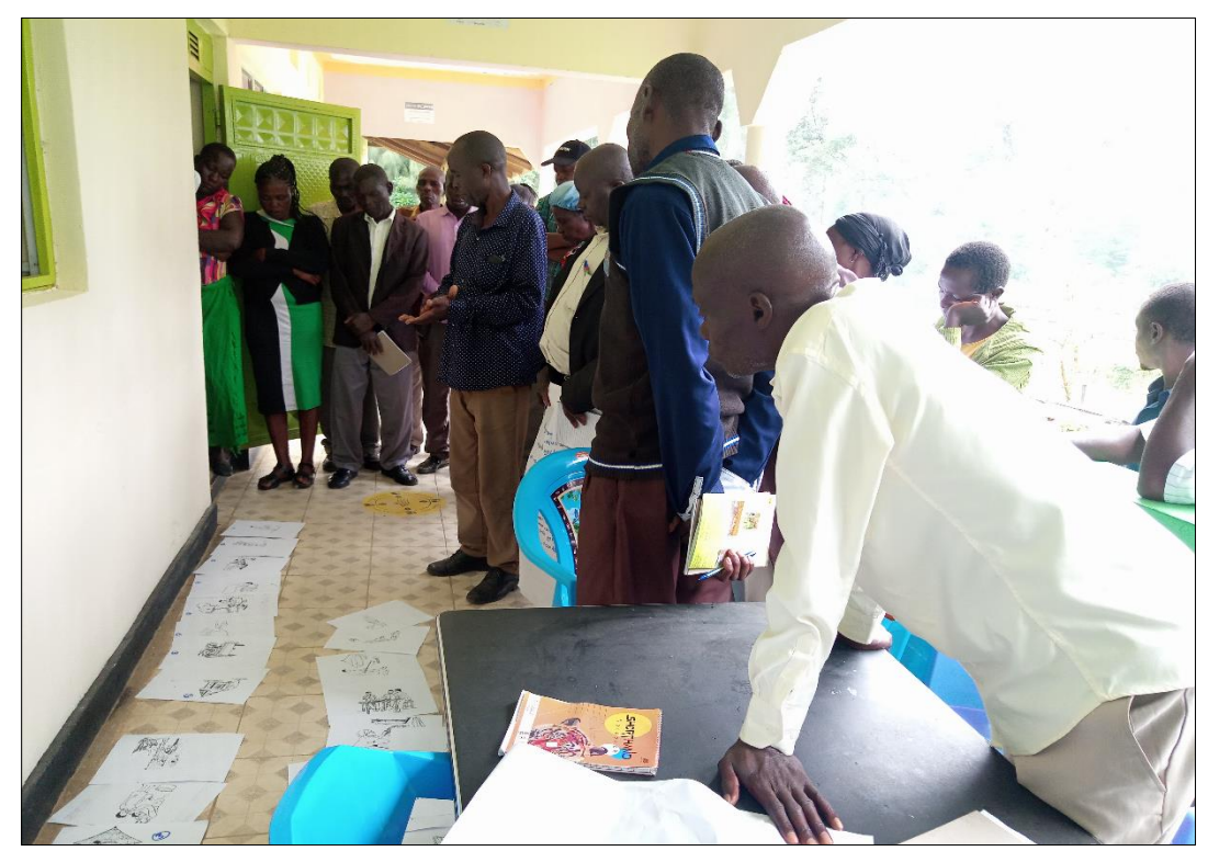
5.0 Group presentation on Sanitation ladders &sanitation improvement