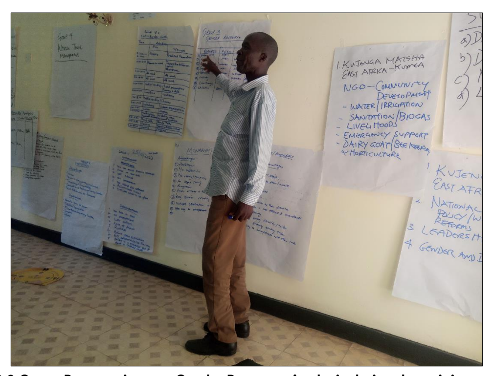
2.0 Group Presentations on Gender Resource Analysis during the training