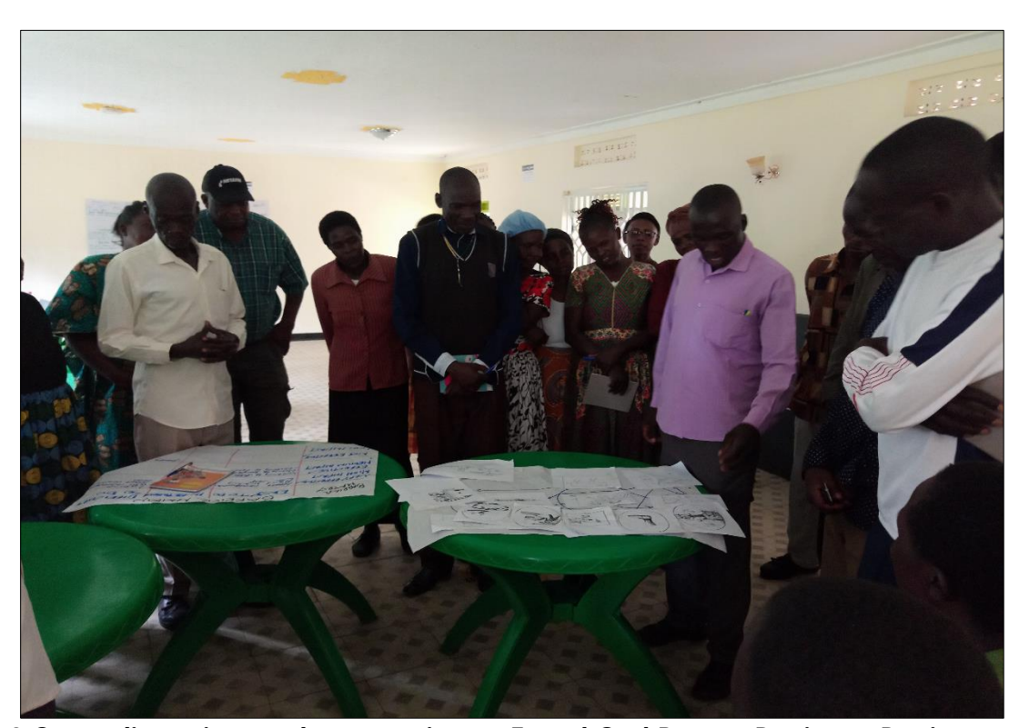
6.0 Group discussions and presentation on Faecal Oral Routes, Barriers & Barrier matrix