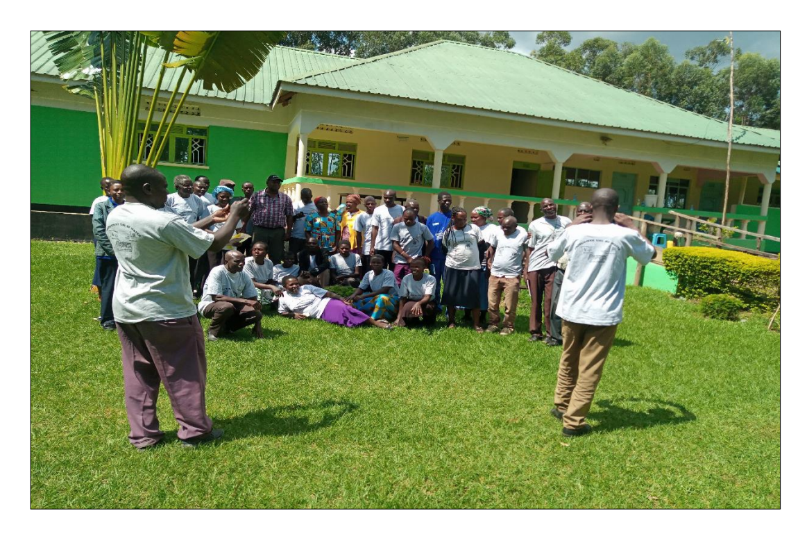
8.0 Group photo of participants and facilitators at the end of the workshop