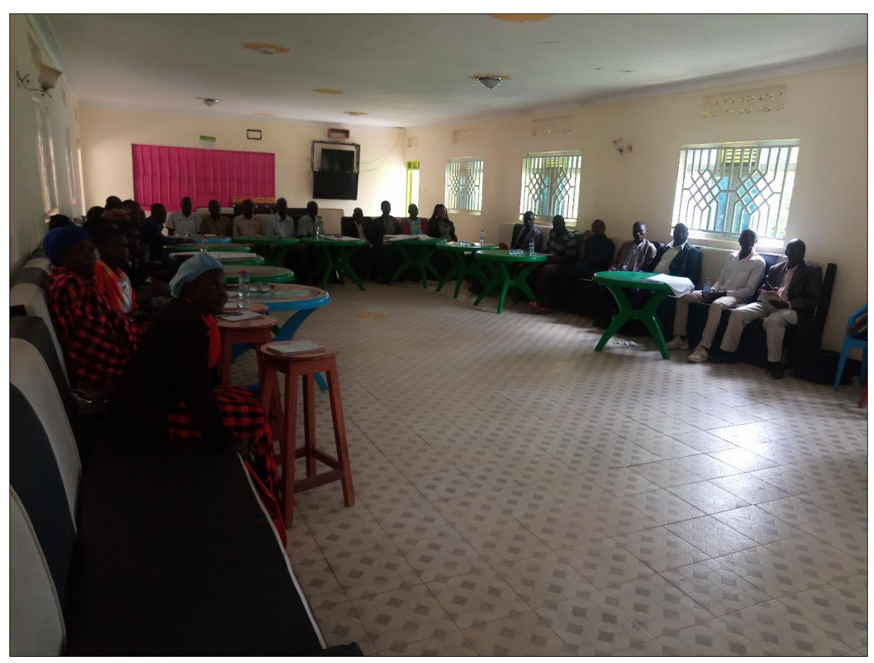
9.0 Participants in plenary during the workshop