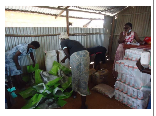
2. Packaging food stuff for distribution to families