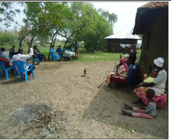
6.Community planning meeting in Kanyagwal village to plan for relief interventions