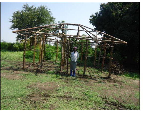
4.Construction of houses with poles before roofing