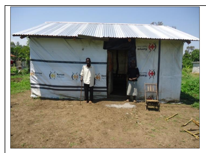
7. Completed house for elderly man with canvas material walling