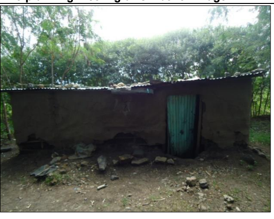
4.Houses destroyed with flood waters in Ongeche village