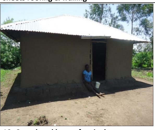
10. Completed house for single parent