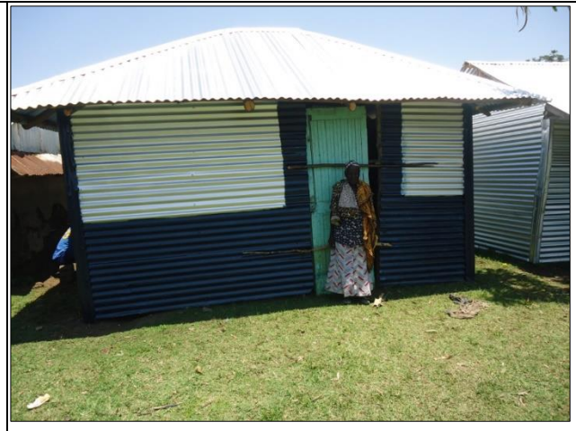
8.Completed house for elderly lady with iron sheets roofing & walling