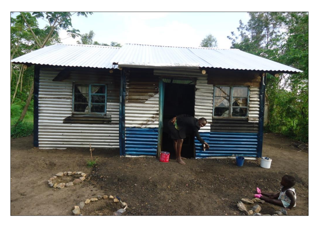
20. Completed house for vulnerable family