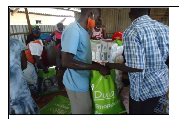
1. Preparing food for distribution