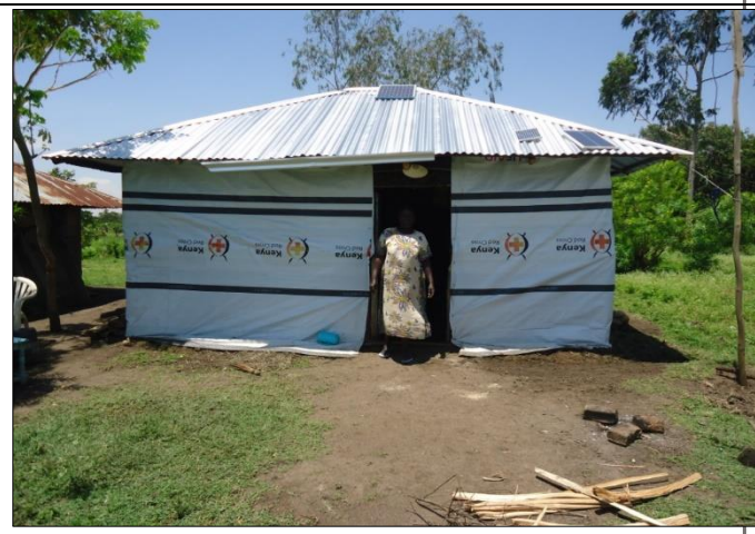
14. Completed house for with canvas walling for vulnerable family