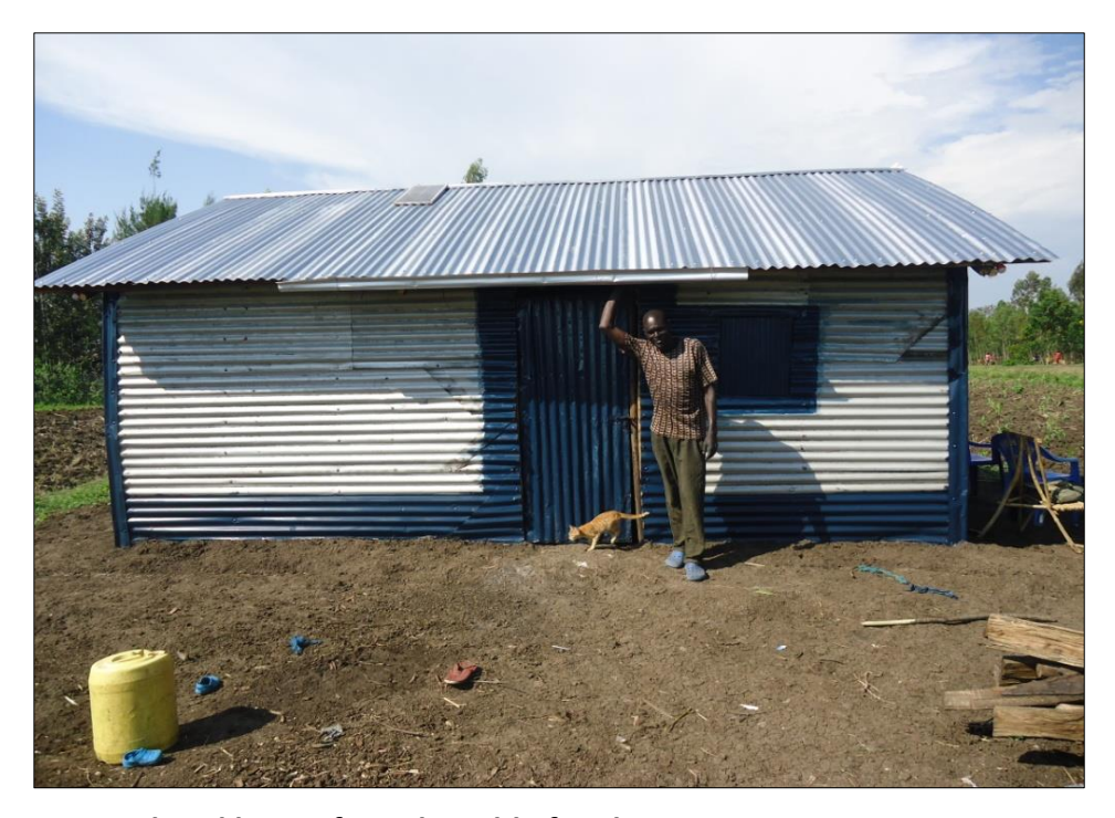
19. Completed house for vulnerable family