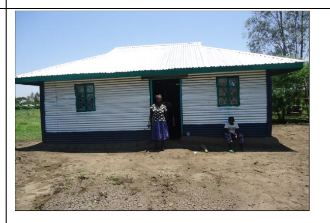
12. Completed house for single parent