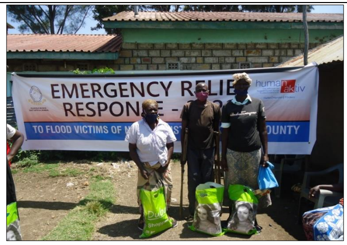
5.Group of persons with disability receiving food stuff packages