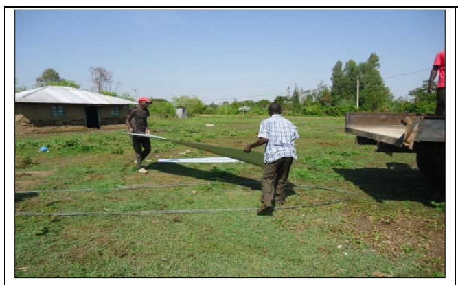
1. Distribution of house construction materials