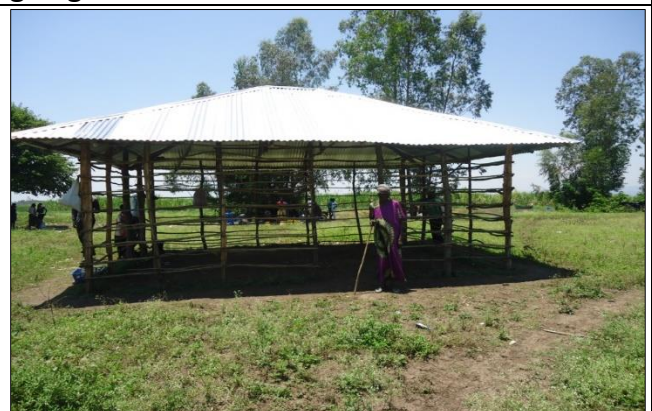
5. Partially completed house with roofing done