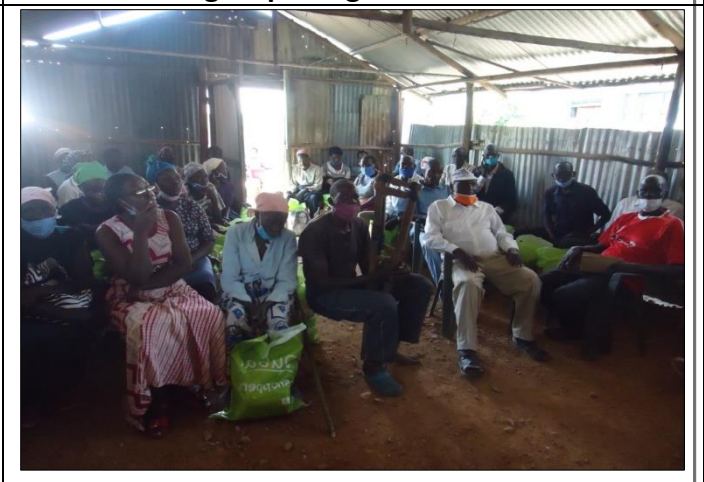
6. Community meeting after distribution of food stuff packages