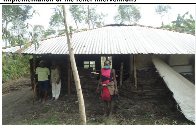
3.Some of the houses destroyed with floods in Omboko village