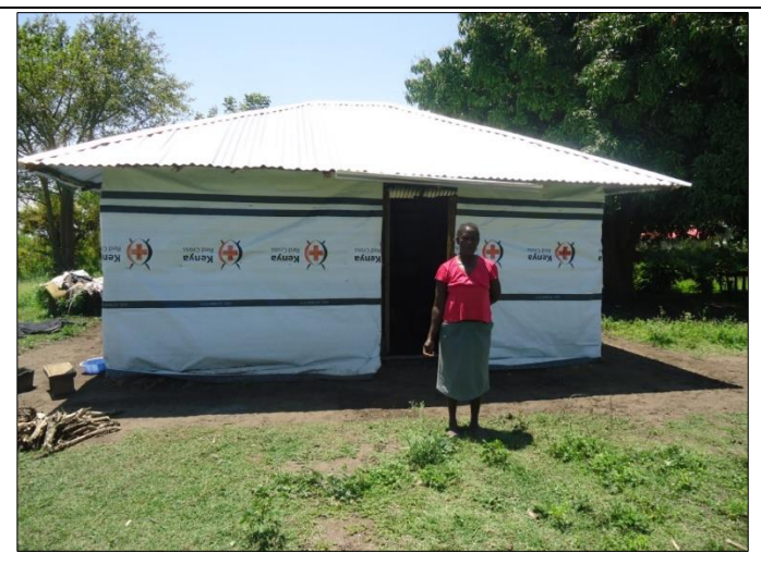
15. Completed house for vulnerable family