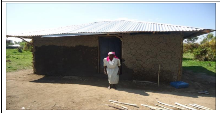
17.Completed house for the elderly & vulnerable family