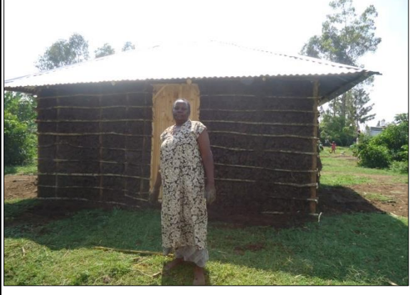
6. Construction of house completed with mud and wattle walls for vulnerable family