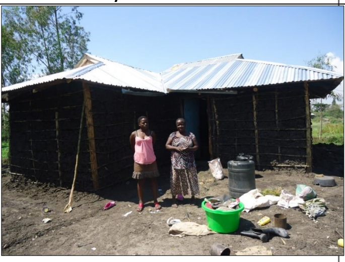
16.Completed house for single parent &vulnerable family