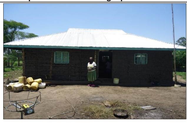
11.Completed house for elderly lady