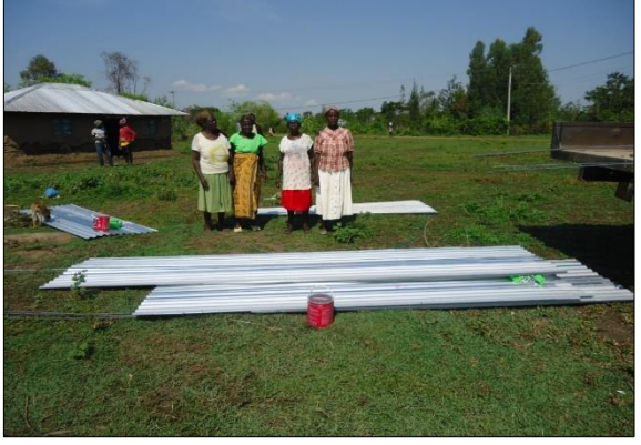
2. Villagers receiving house construction materials