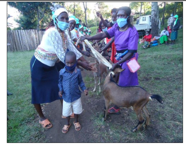
6. The two groups exchanging goats during the pass on process