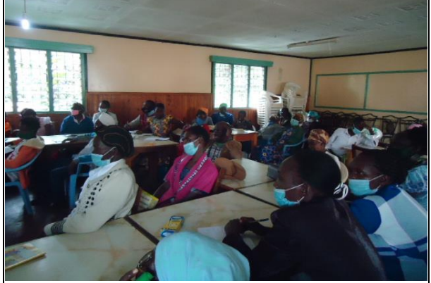
5.Participants taken notes and listening to discussions