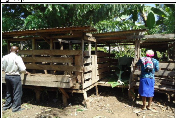
11.Checking a Well-Constructed Dairy Goats stable by group members