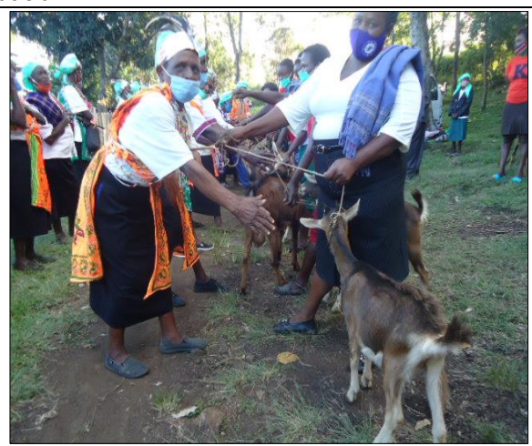
4. The two groups exchanging goats during the pass on process