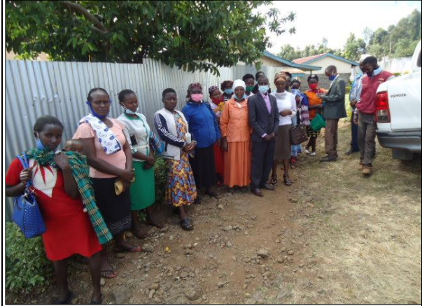
9.Group photo of Wendo Mwega Women group