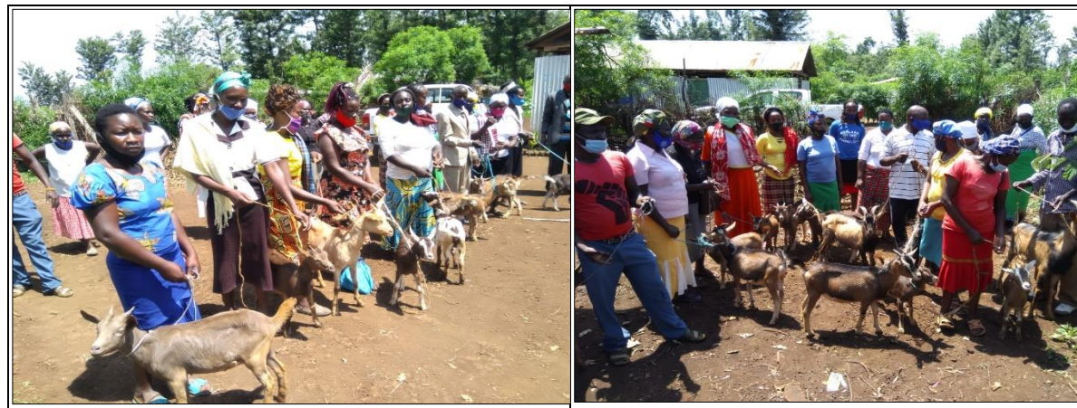
1.Makena Kathangene women group bringing goats for pass on to Wendo Mwega group

ANNEX 1A: PASS ON PHOTOS FOR THR NEW GROUPS- WENDO MWEGA WOMEN GROUP RECEIVING DAIRY GOATS FROM MAKENA KATHANGENE WOMEN GROUP