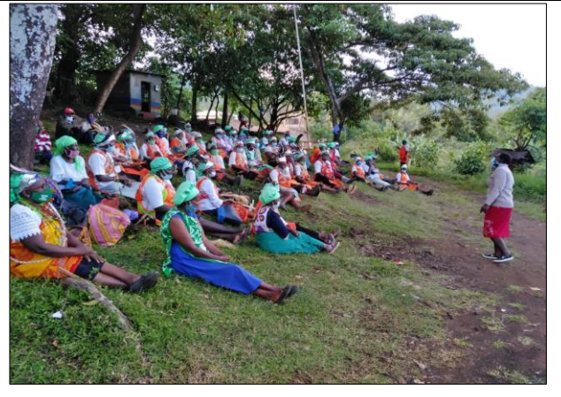
2. Chairperson of Mwendwa Akui women discussing with both groups in regards Dairy goats project impacts