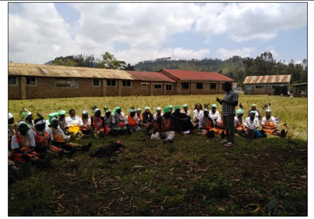
1. Initial meetings for pass on groups beneficiaries' identification process