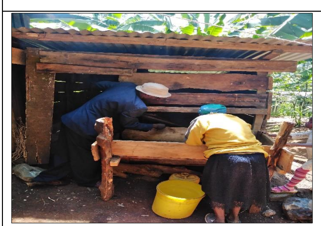
3.Inspection of the completed animal stable/pen for Kamanu Women group member