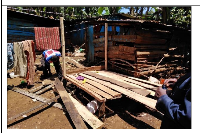
5.Construction of the animal stable/pen for Wendo Mwega women group member