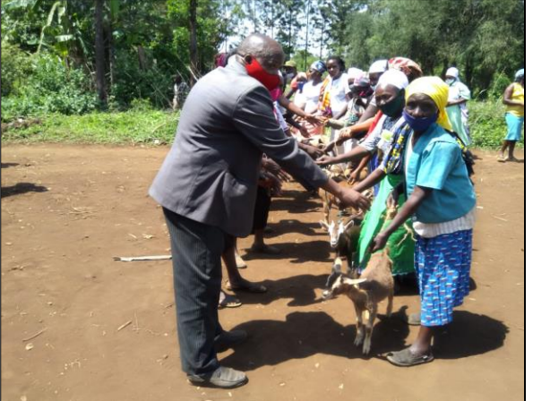
6. Makena Kathangene women group pass on goats to Wendo Mwega women group