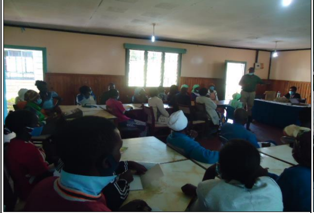
1.KUMEA Program coordinator giving introductory remarks &overview