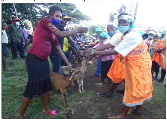
5. The two groups exchanging goats during the pass on process