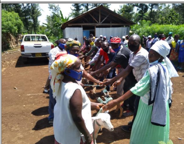
3. Makena Kathangene women group pass on goats to Wendo Mwega women group