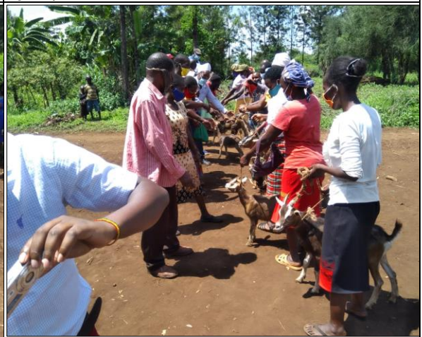
4. Makena Kathangene women group pass on goats to Wendo Mwega women group