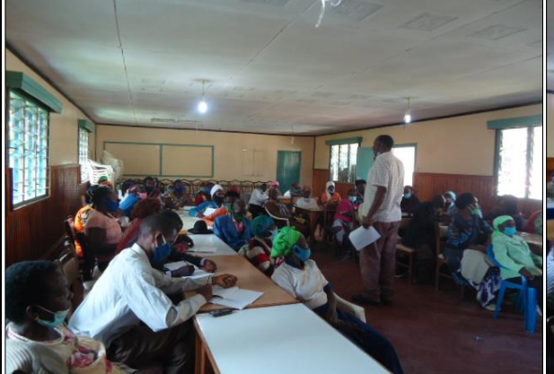
3.Livestock Officer undertaking plenary discussions on Animal husbandry