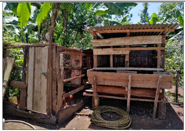
4.Completed animal stable/pen for Kamanu women group member