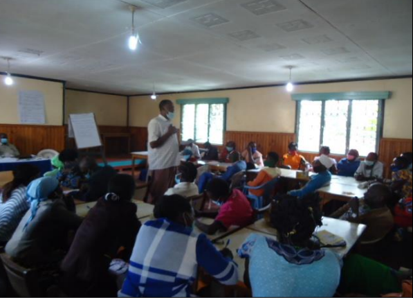
4.Plenary presentation by the Livestock officer on key issues