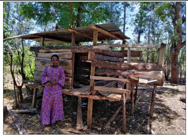
2.Wendo Mwega women group member completed construction of the animal stable/pen