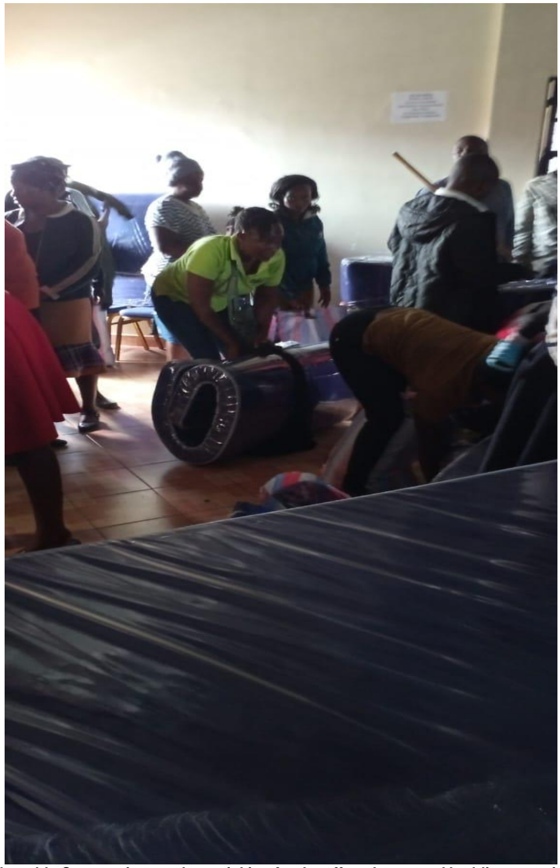
9.0 Vulnerable Community members picking food stuff packages and bedding materials