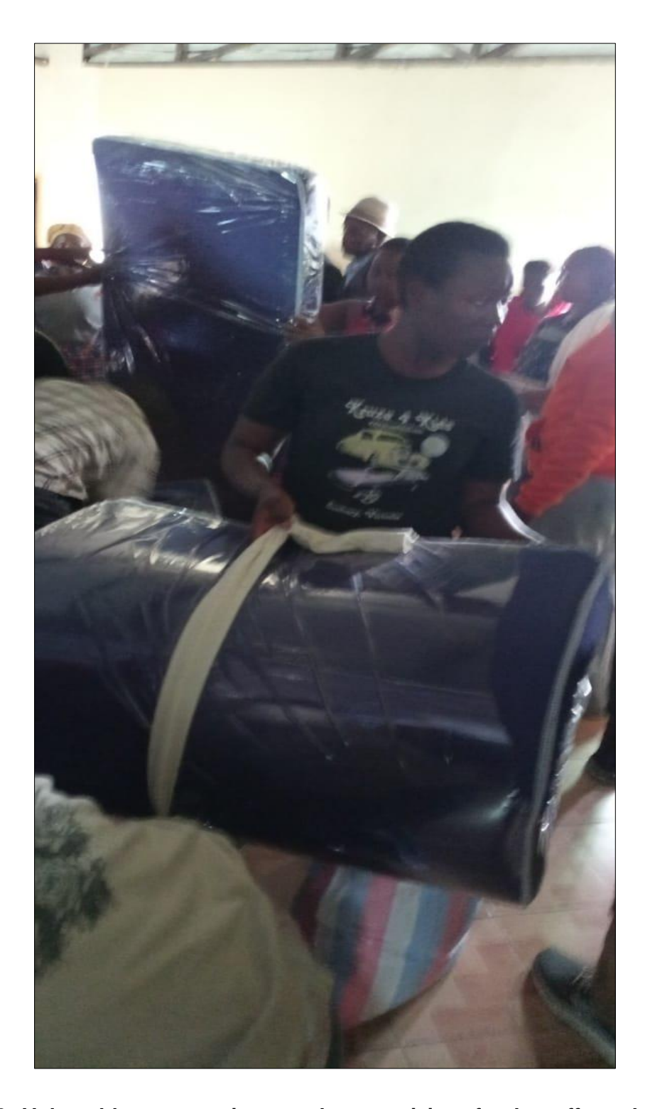
8.0 Vulnerable community member receiving food stuff packages &bedding materials