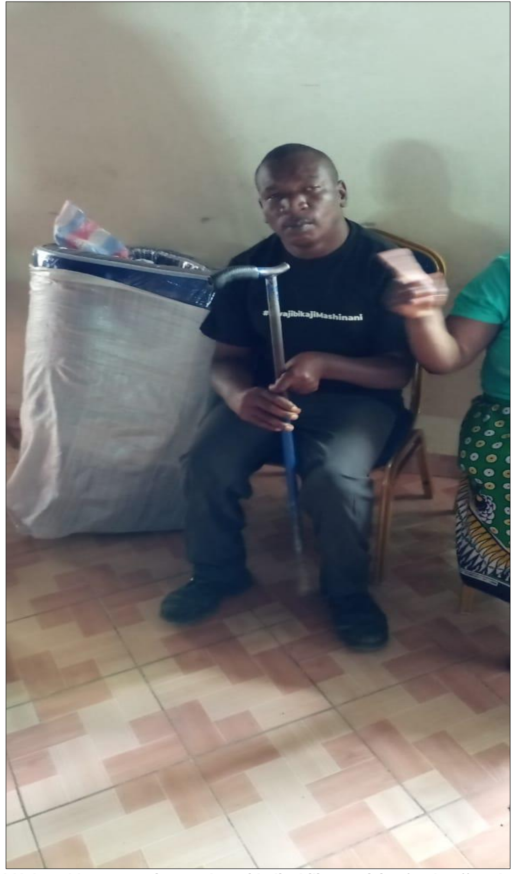
6.0 A Vulnerable community member with disability receiving foodstuff package and bedding materials