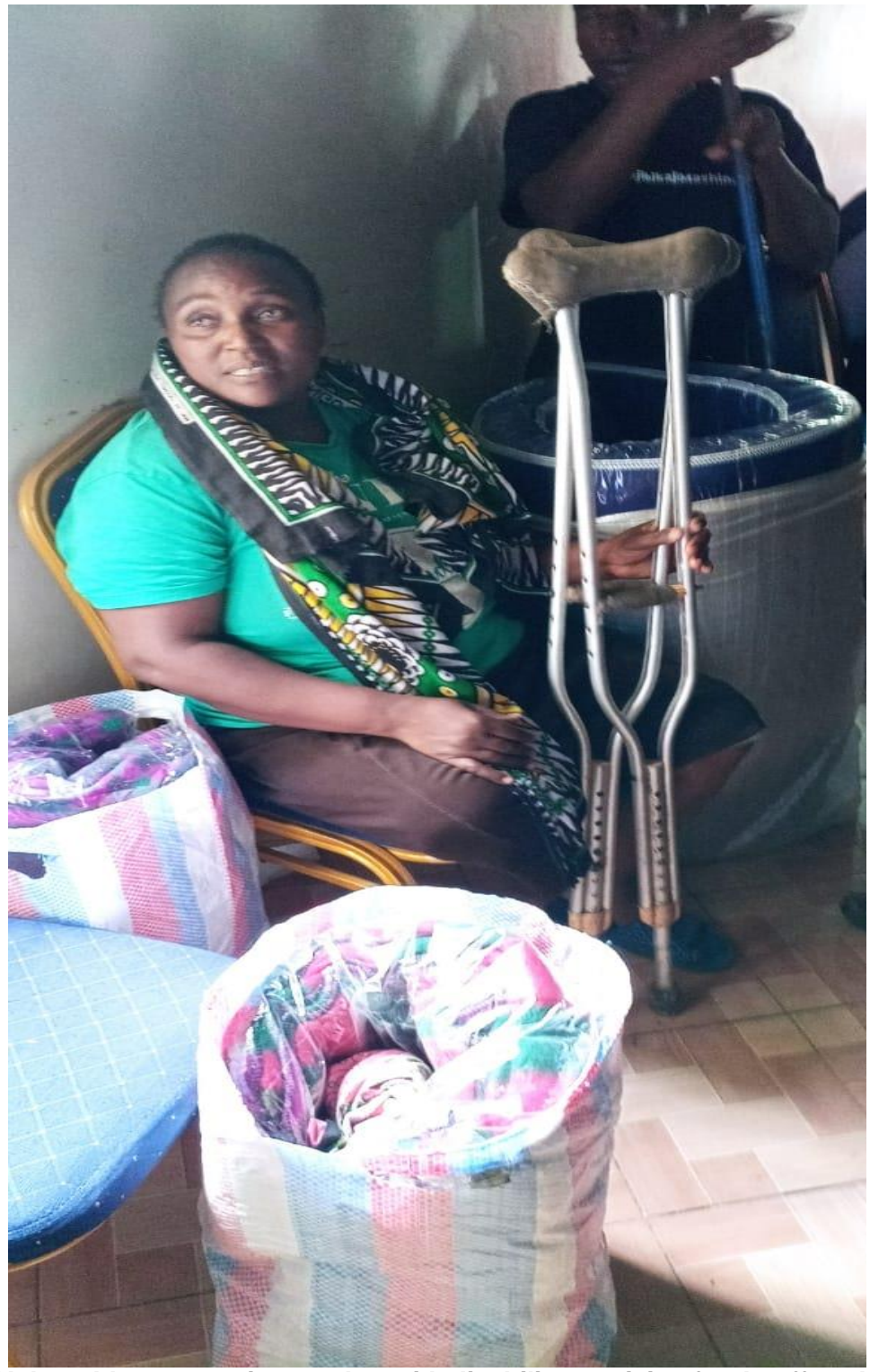
5.0 A Vulnerable community member with disability receiving foodstuff package and bedding materials