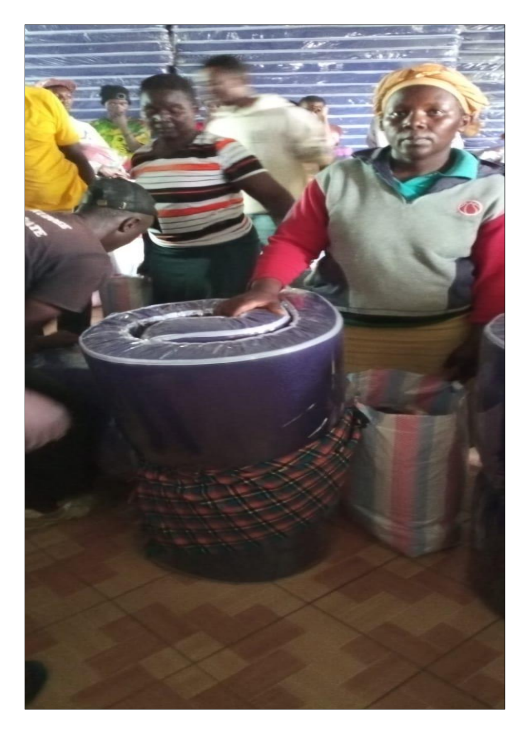
4.0 Venerable community receiving foodstuff packages and bedding materials