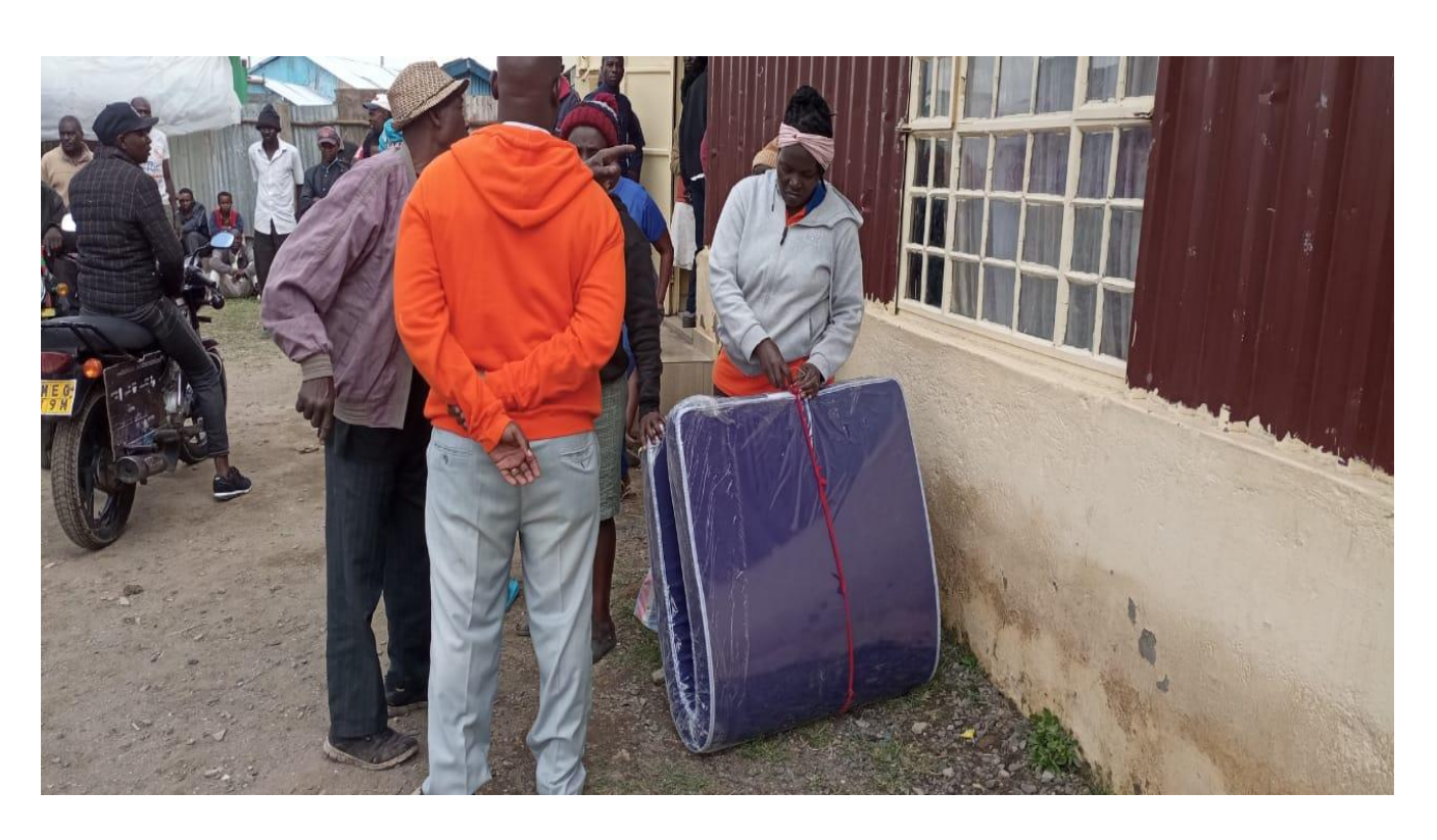
11.0 Vulnerable community members transporting their foodstuff packages and bedding materials to their homes