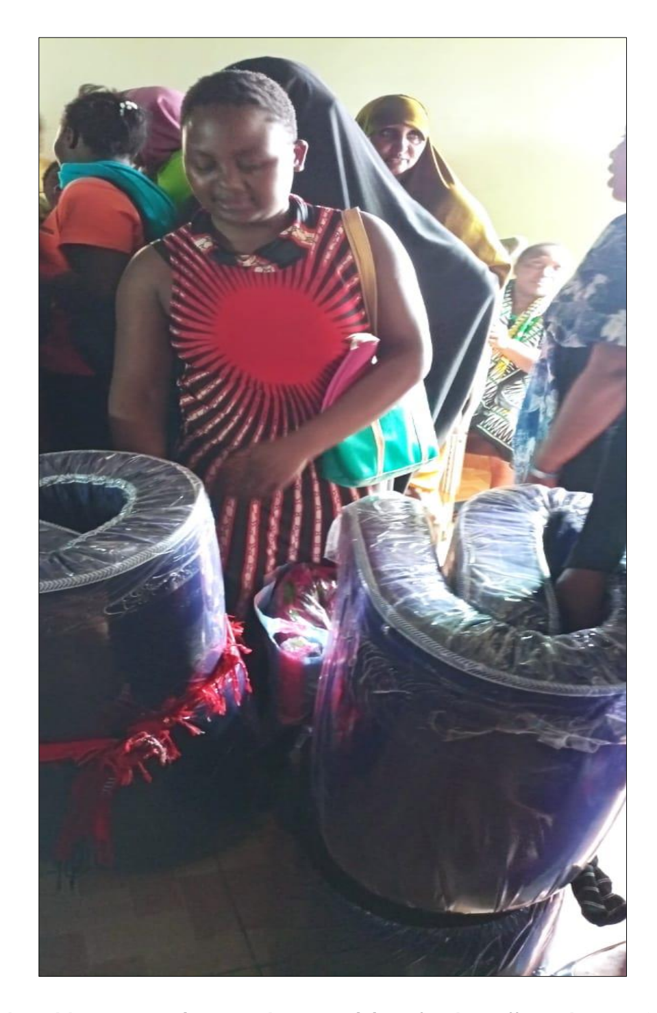
7.0 Vulnerable community member receiving food stuff packages &bedding materials