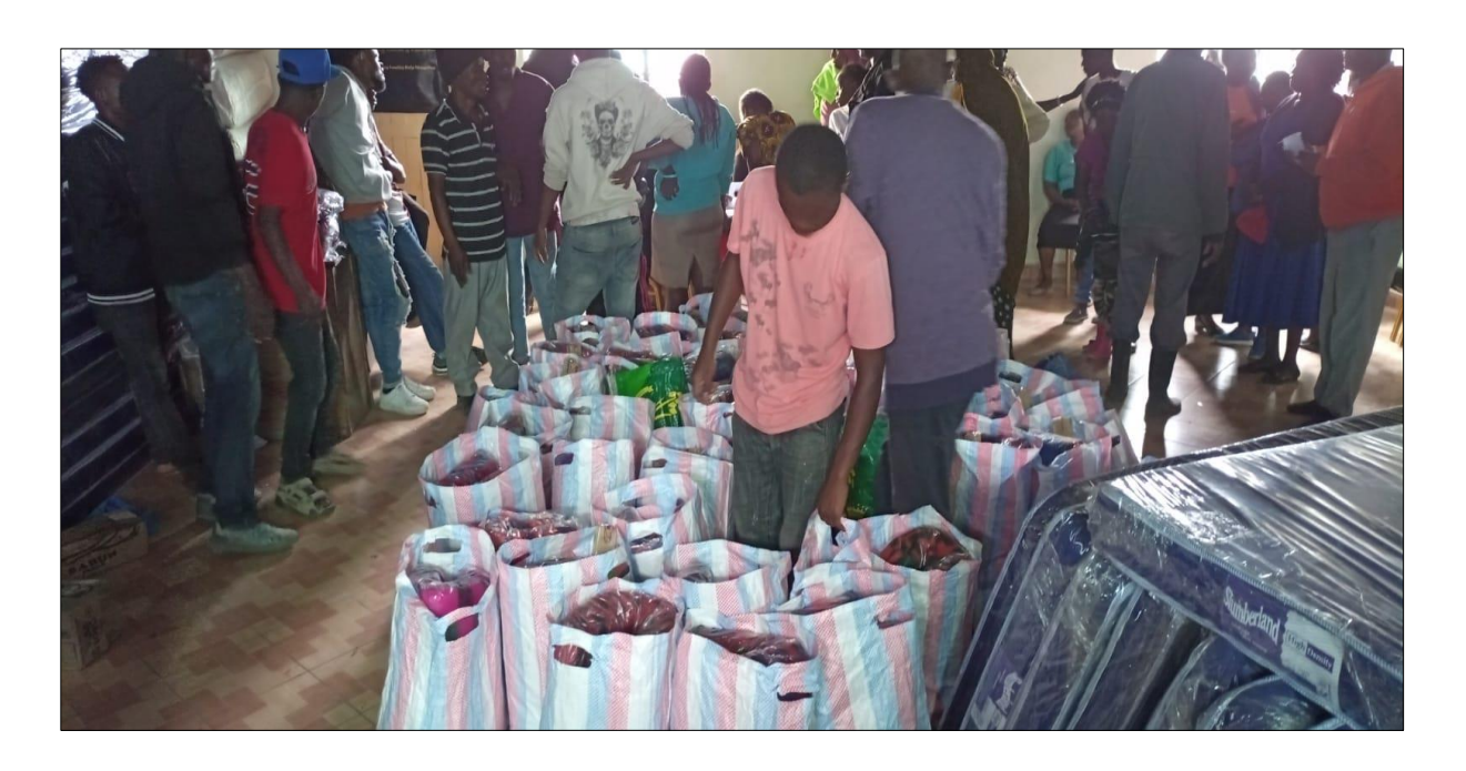
2.0 Food stuff packages &bedding materials ready for distribution