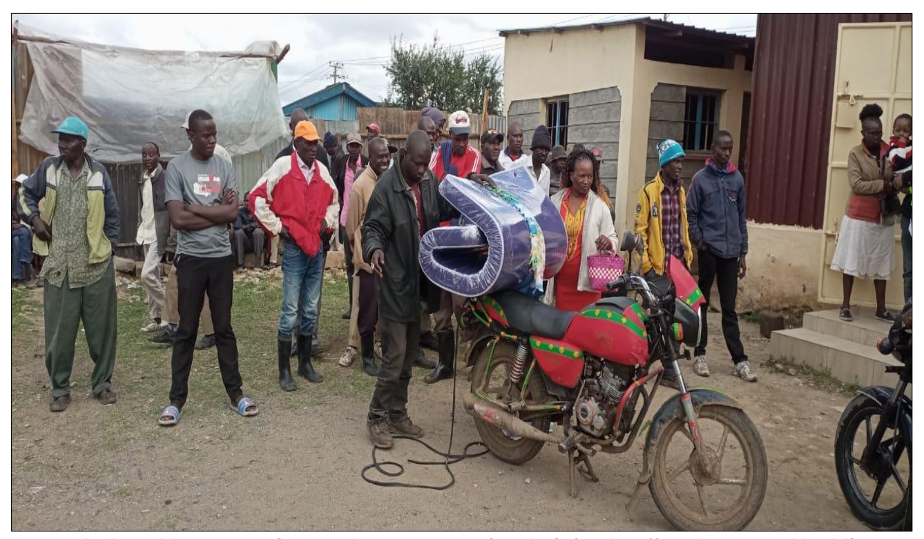
10.0 Vulnerable community members transporting their foodstuff packages and bedding materials to their homes