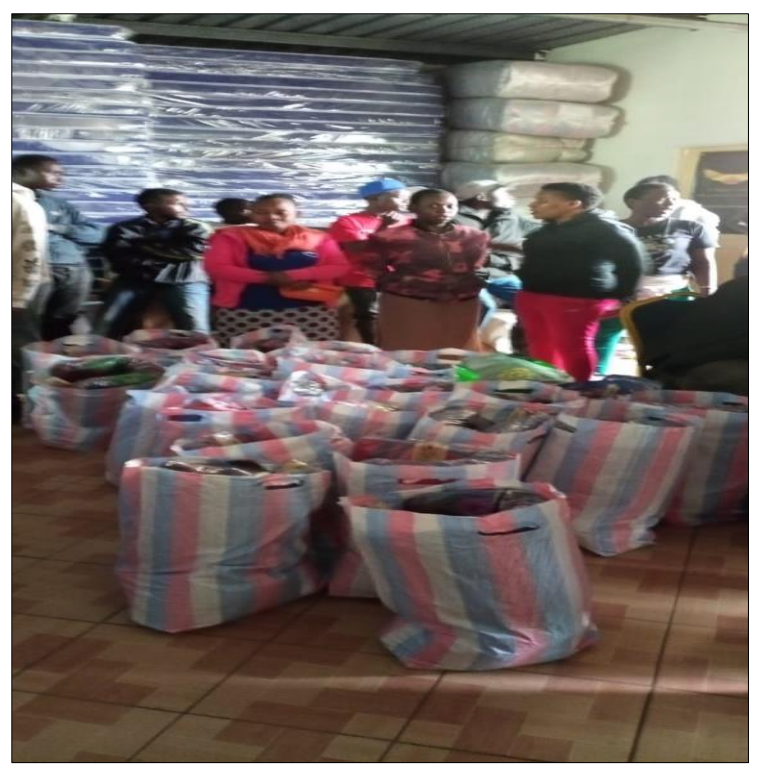
1.0 Food stuff packages & bedding materials being prepared for distribution