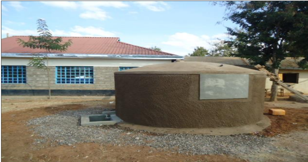
f) Katulani primary school Ferro-cement tank completed and in use