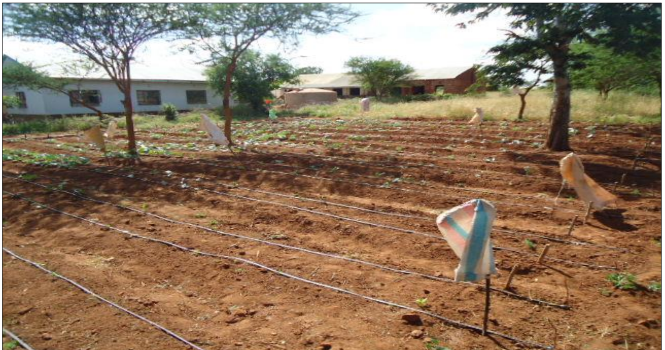
q) Miamba primary school drip irrigation farm being developed