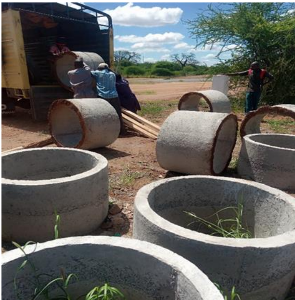
5.0 Loading culverts to Water point sites