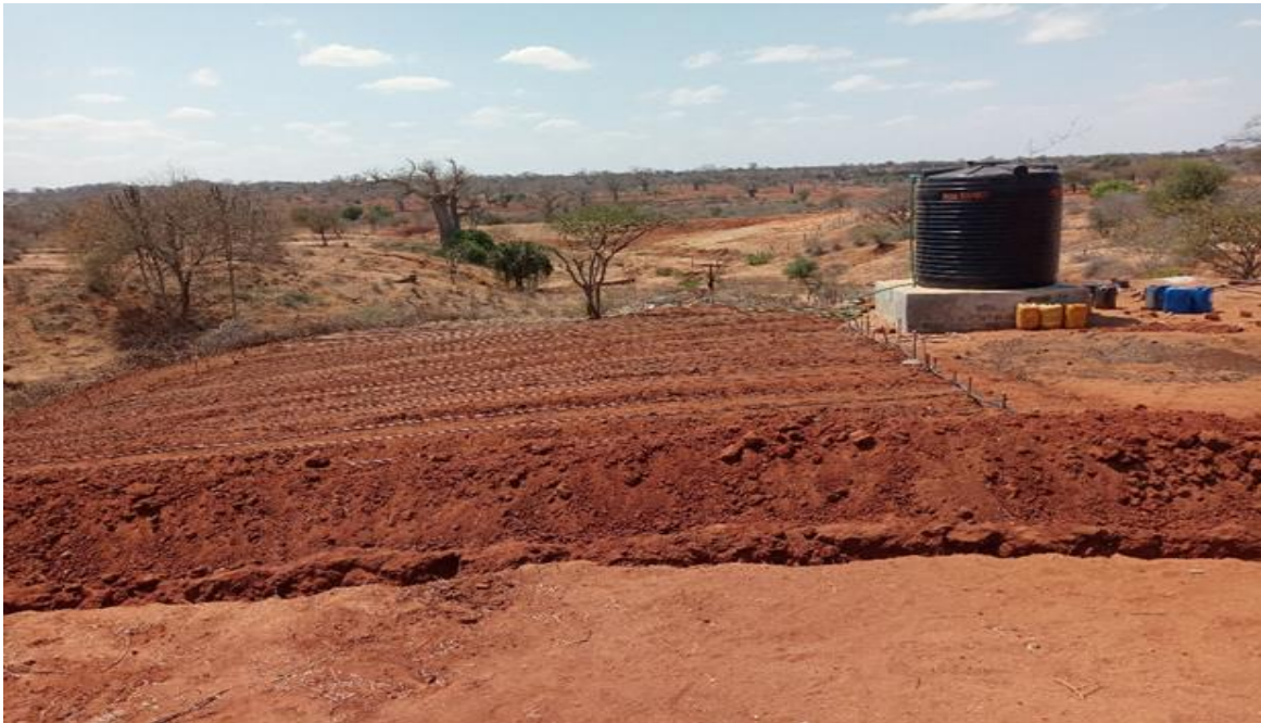
B) Wikwatyo women group Water point drip irrigation system installation