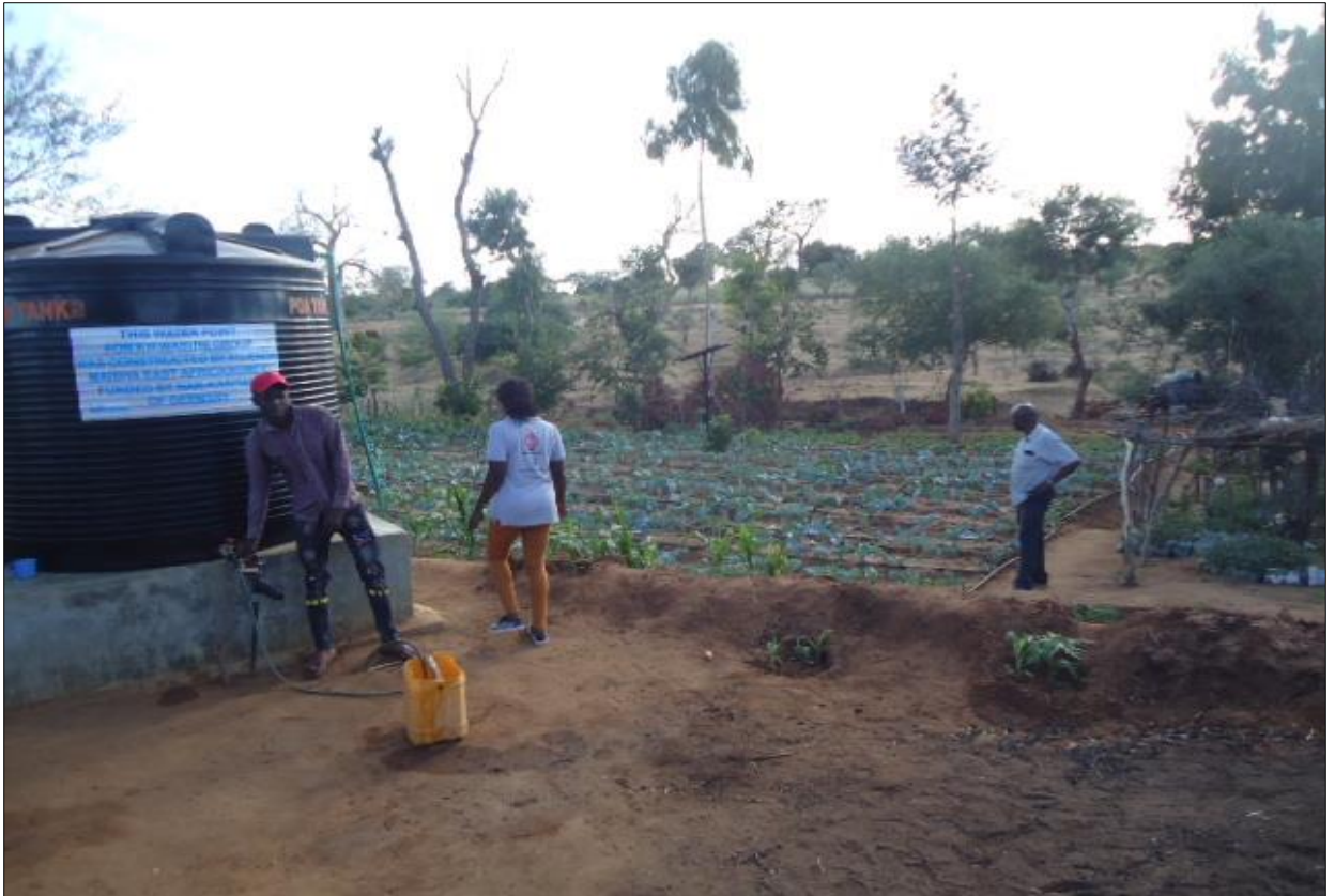
l) Kikwasuni water point with drip irrigation system and tree-Nuseries production site