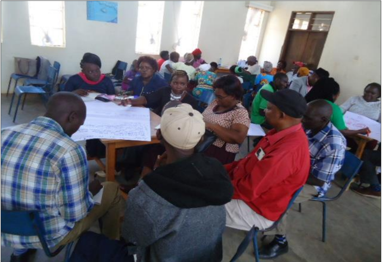
1.0 Group discussions during quarterly review meeting for participatory Monitoring process for project implementation review in Kibwezi East Ward