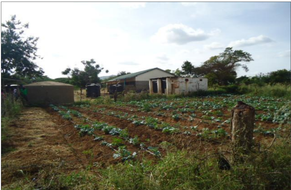
o) Ferro-cement Water & Drip irrigation system providing water for the school agriculture demonstration farm-Katulani Primary School