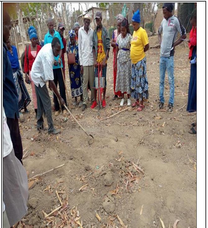
g).Shallow Weeder demonstration &application