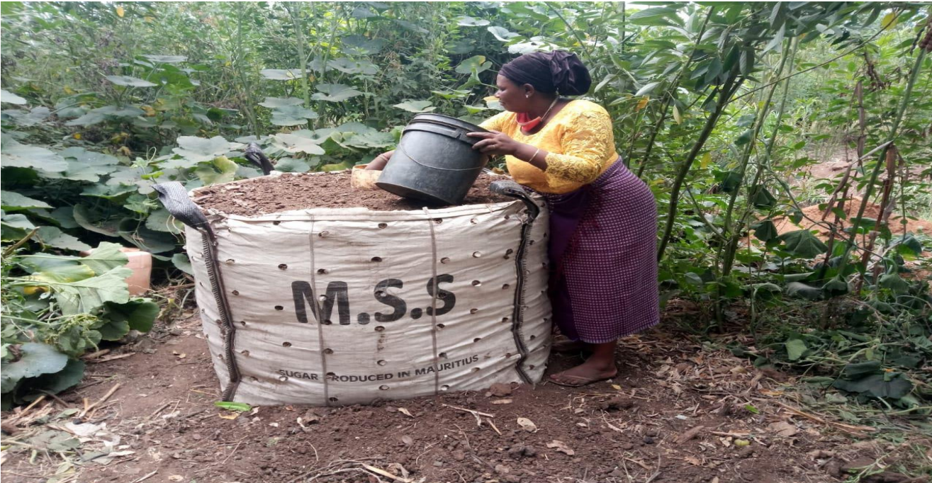
b) Makueni Kitchen garden women group carrying vegetable production activities in Kibwezi west ward