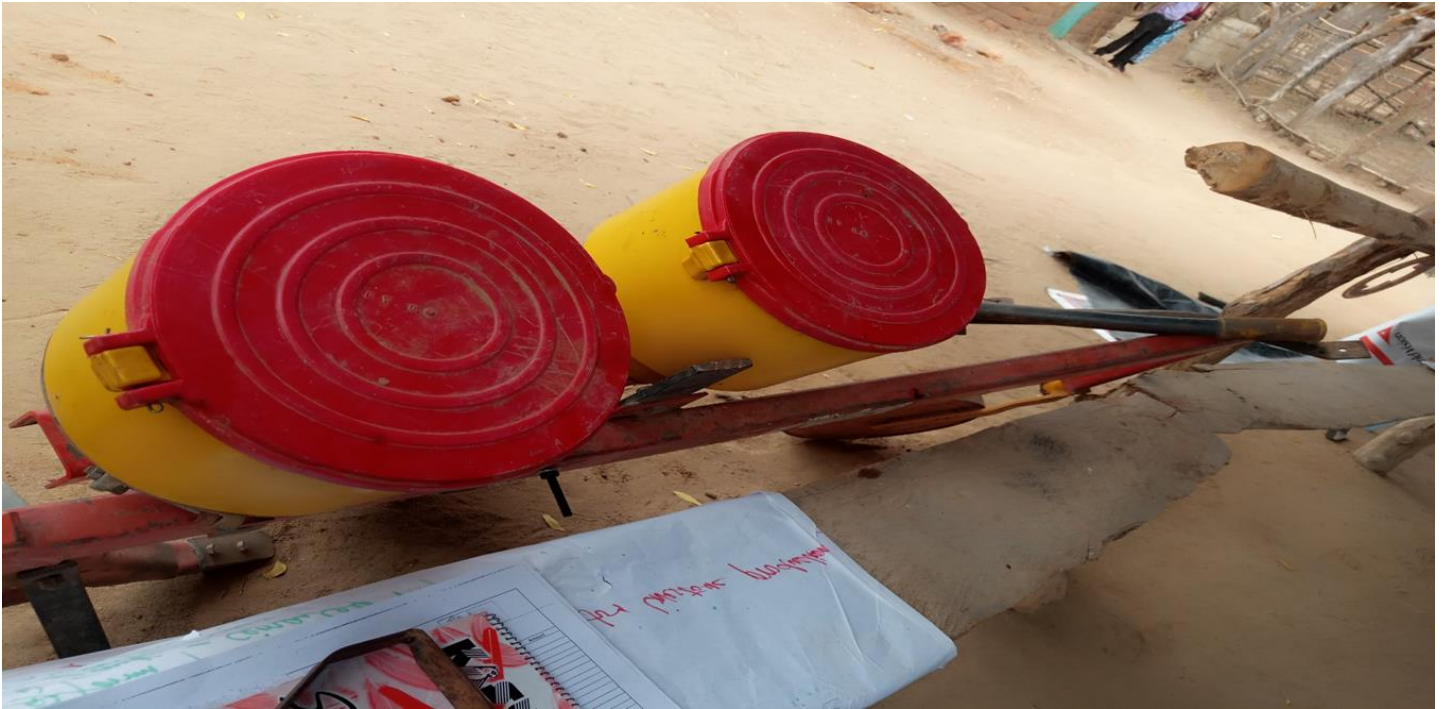
d) Animal Drawn planter being demonstrated