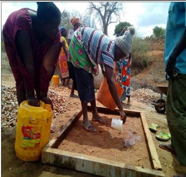
c) Preparing for concrete mixing for Slab manufacture