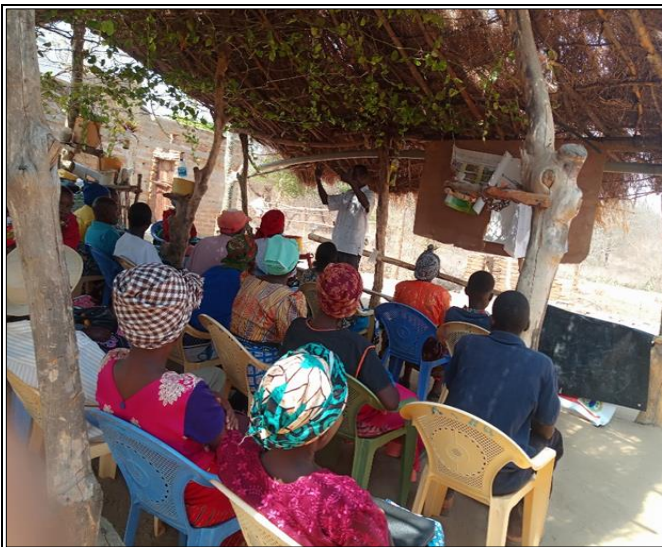
a) Farmers group orientation in Kibwezi East Ward