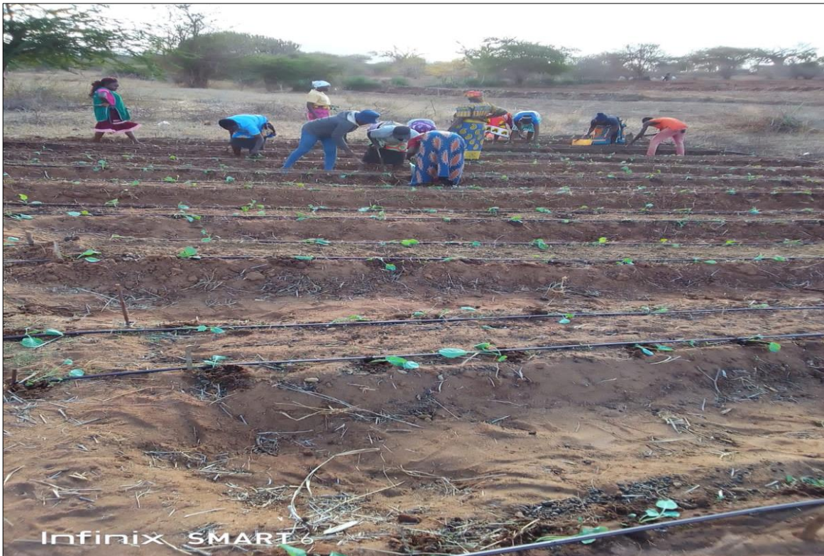
C) Transplanting of vegetables at Neema ya Mungu women group water point site