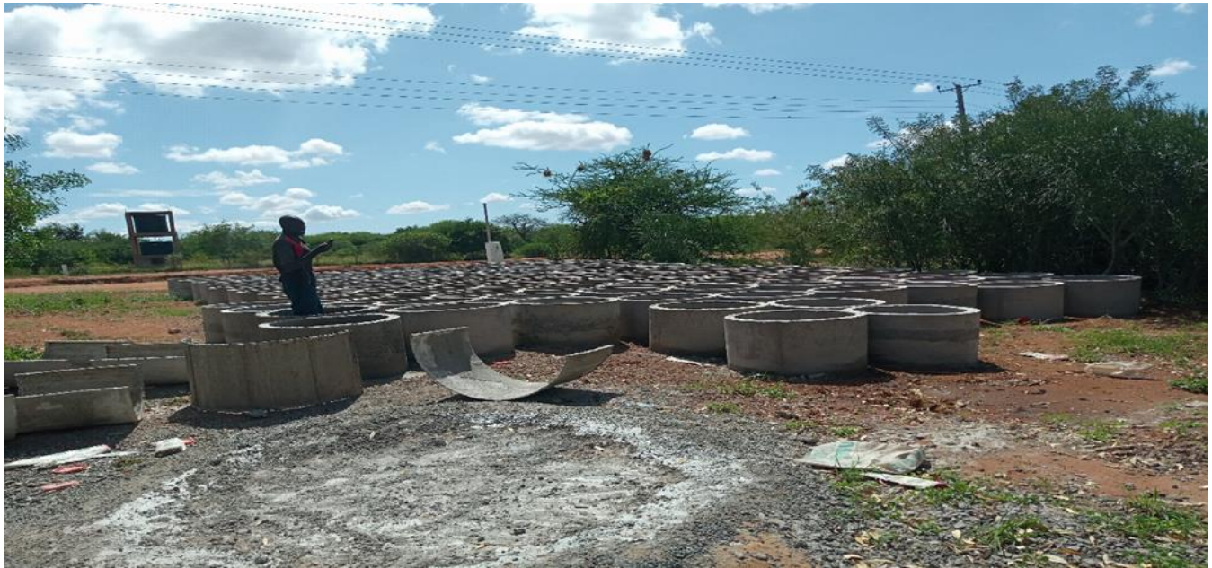
4.0 Culverts rings production at Pamwamu site –Culverts used for lining of hand /Shallow dug wells