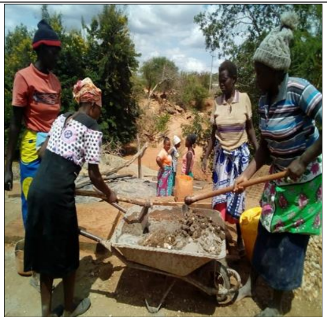
b) Women mixing sand, cement & ballast