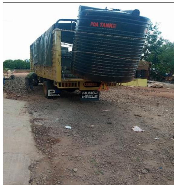
6.0 Transporting materials to Water point sites