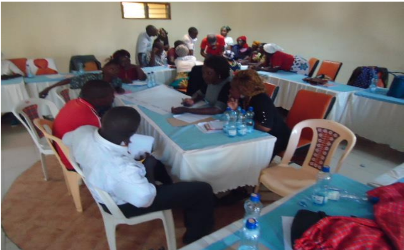
b) Group discussion sessions on Leadership styles