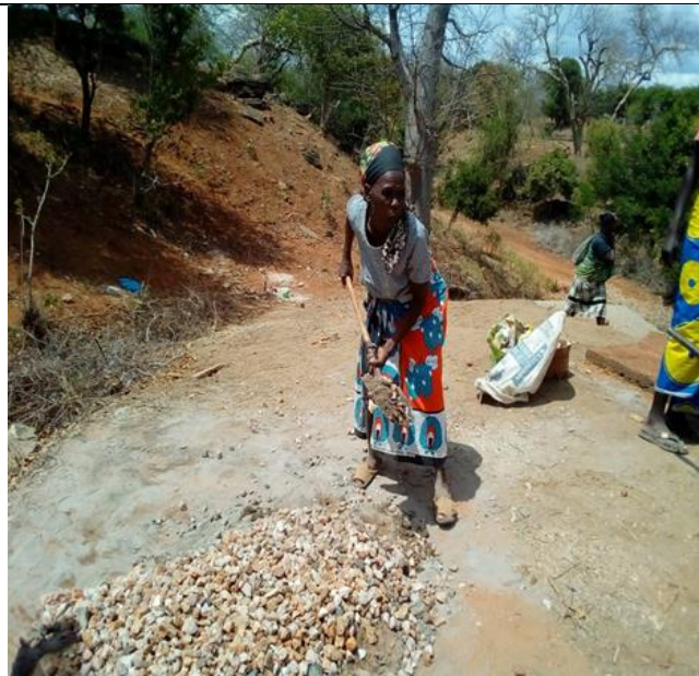
a) Women community members mobilize materials