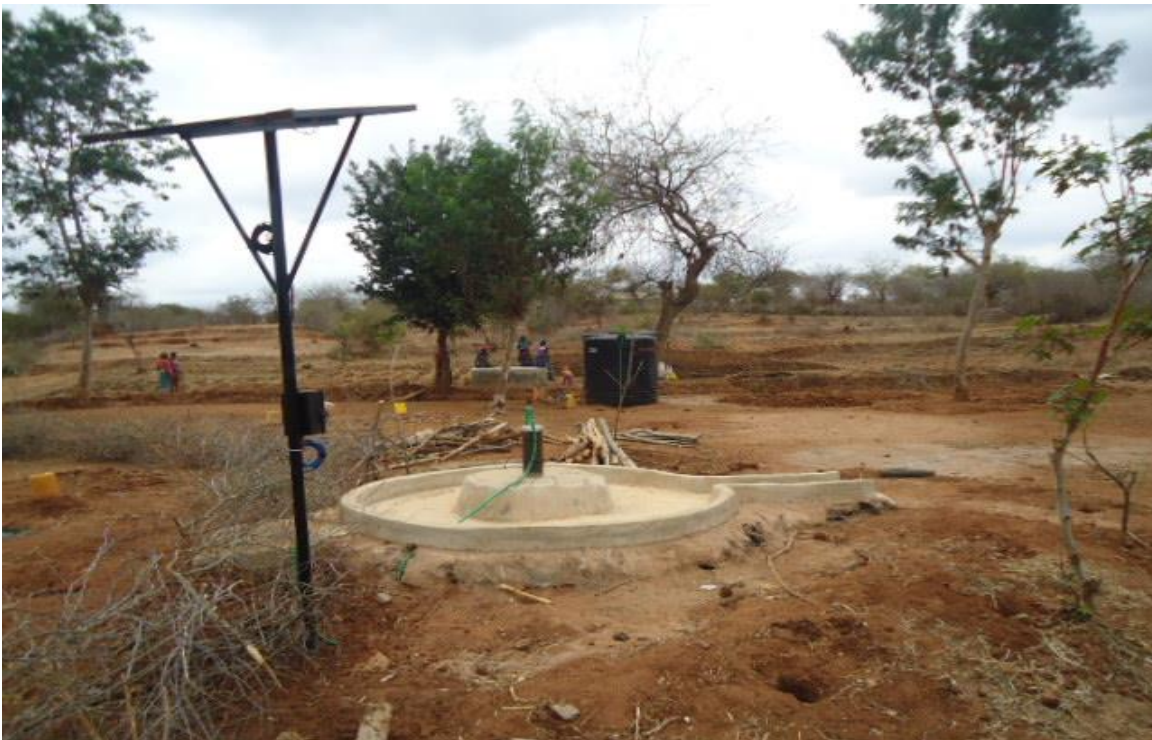
i). Wise women water point completed with solar pumping unit