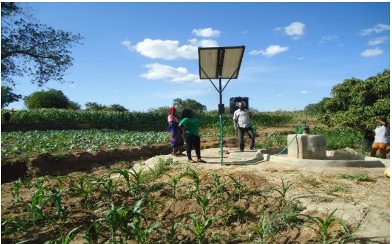
m) Kyeni Chan Ngini water point with solar pumping system and drip irrigation farm