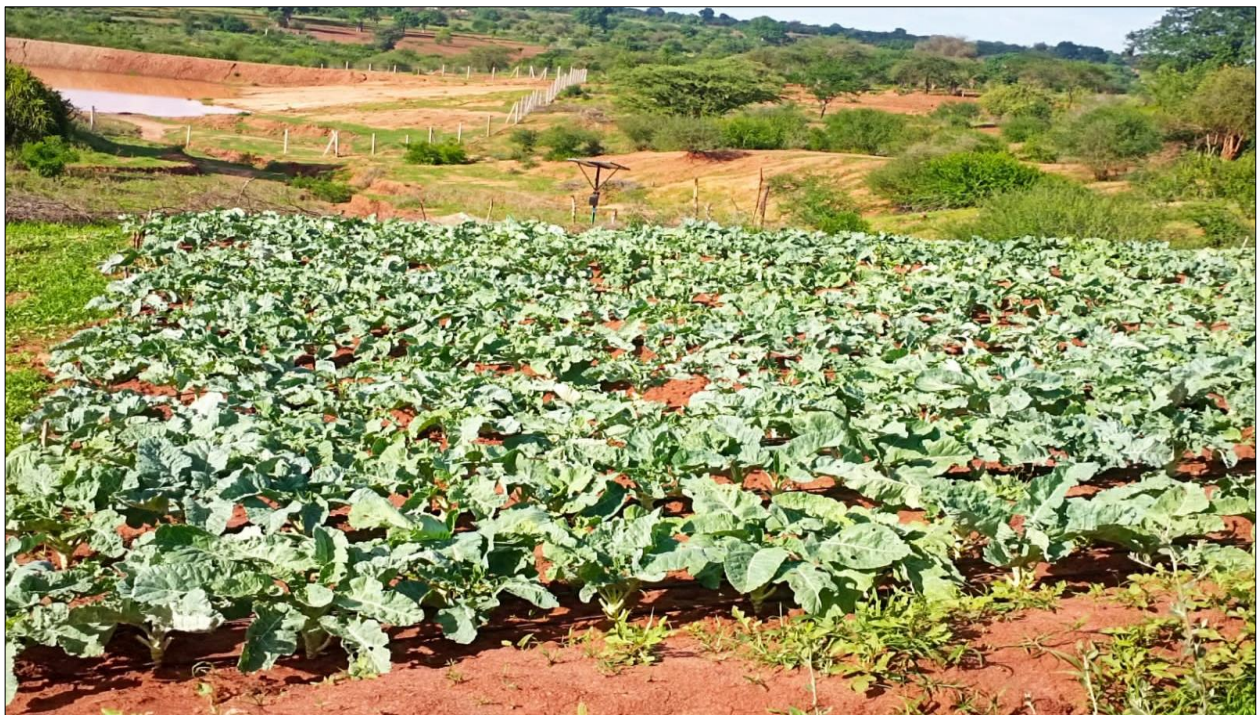
e) Vegetable production farm at Ngwatania Misuuni Group water point in Misuuni village – Kibwezi West ward/location