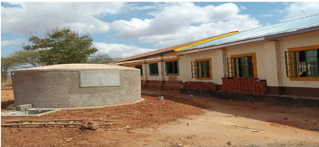
g) Ndauni primary school Ferro-cement water completed and in use