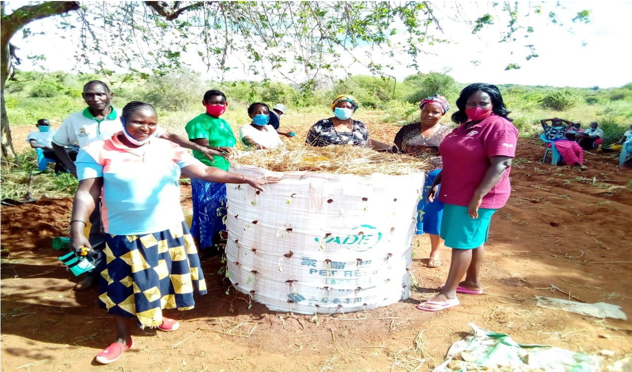
a) Makueni Kitchen Garden women group demonstrating their activities in Kibwezi west Ward