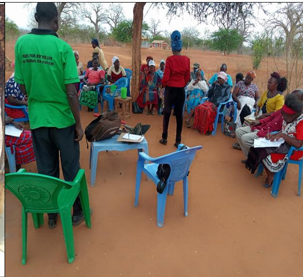
b) Farmers group orientation in Kibwezi West Ward