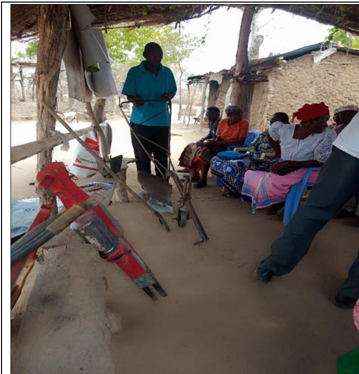
f).Presentation of shallow weeder