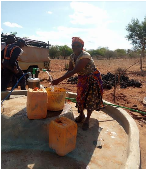
a) Solar pump installation at Wise Women water point