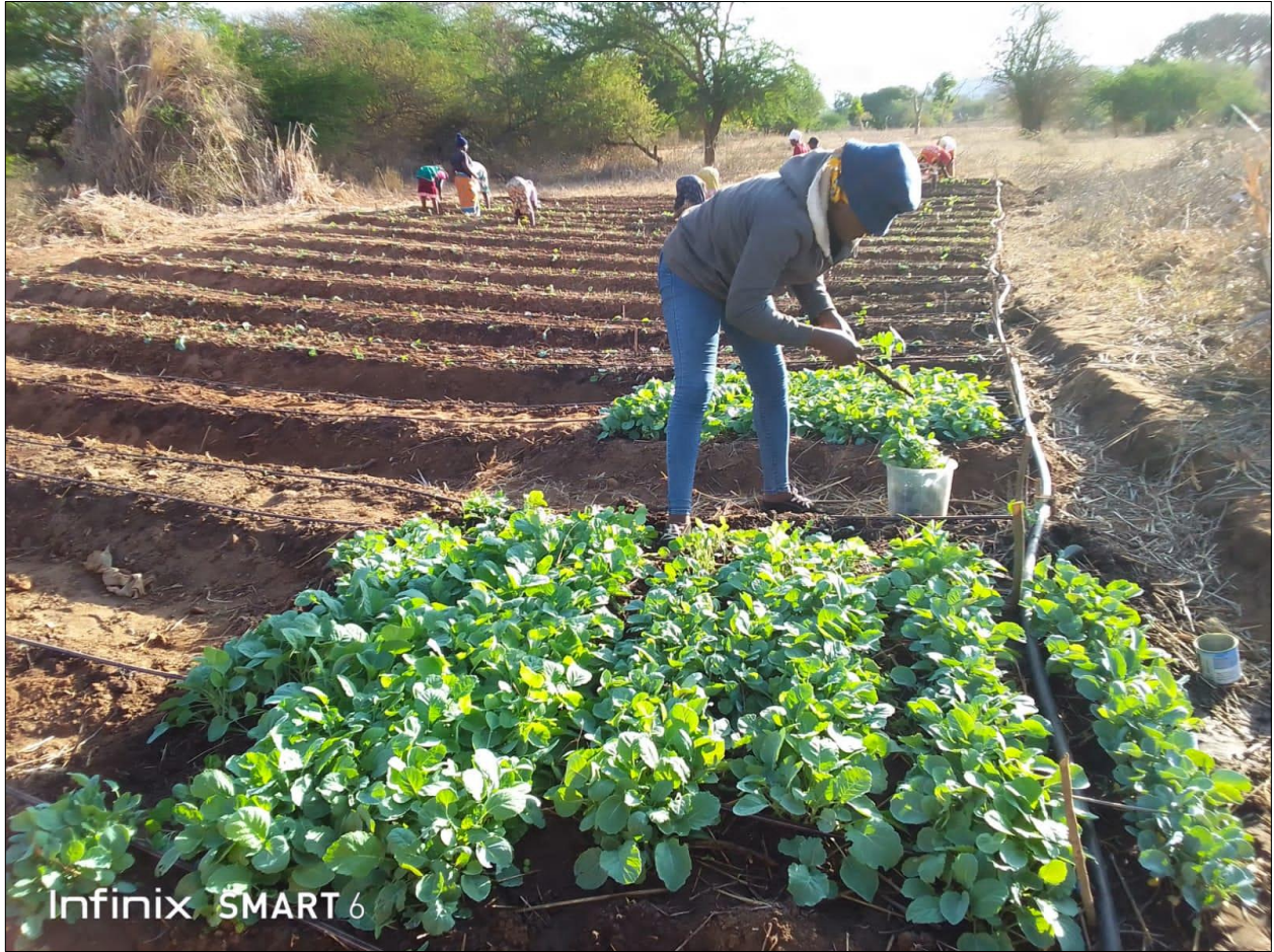
d) Seedbed development at Neema ya Mungu women group water point site