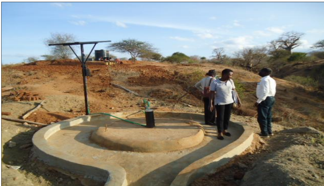
h).Ngwatania ya Misuuni Water point completed with installed solar pumping unit