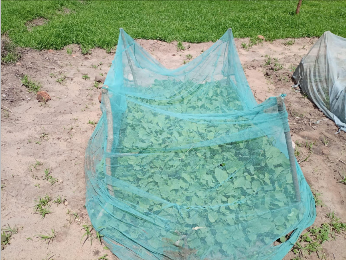
c) Kitchen Garden vegetable seedlings preparation at Kutalani village –Neema ya mungu women group