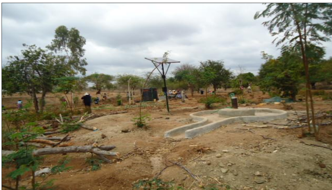
j). Wikwatu Mbaitu water point completed with solar pumping unit