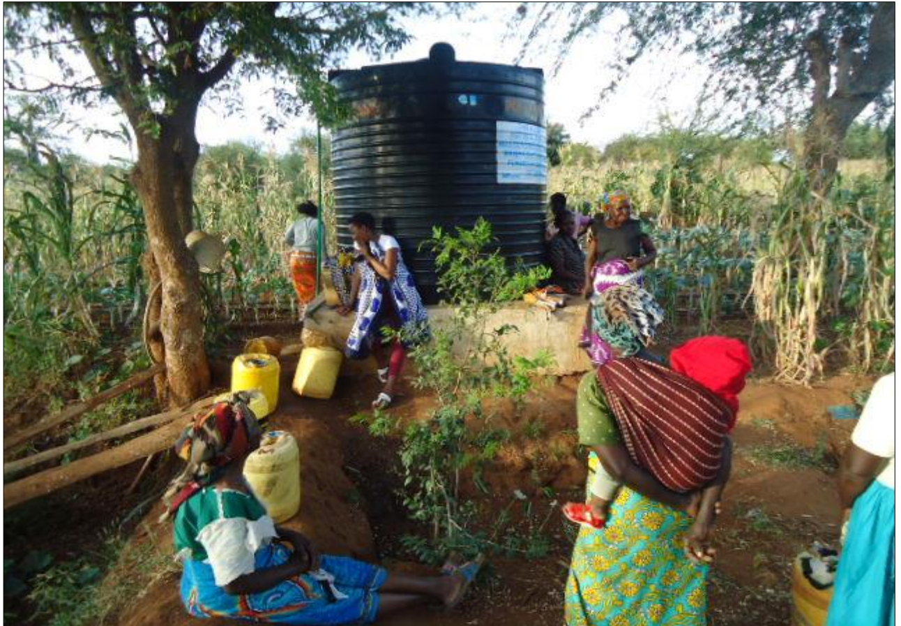
p) Women collecting water from Wise women-Nyekindune village water point site as they check on their vegetable production farm