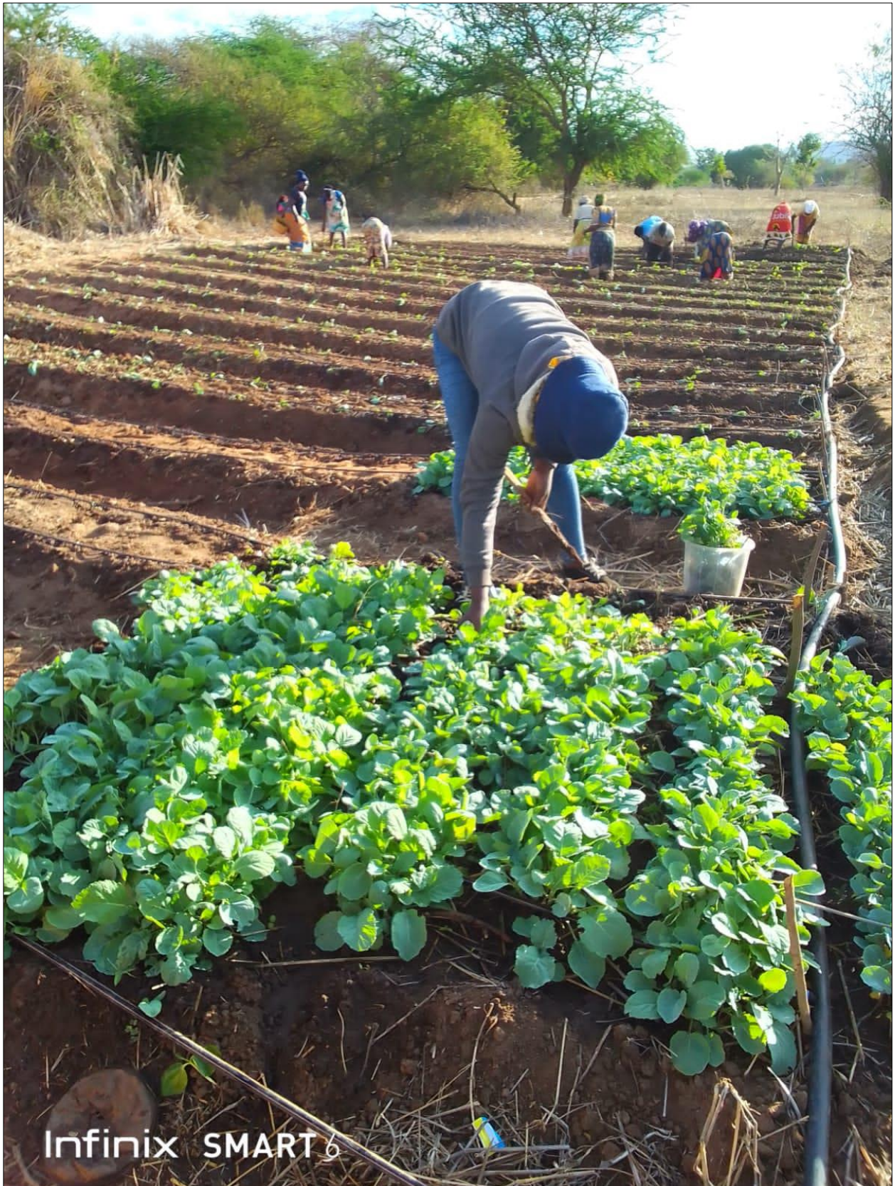
a) TRANSPLANTING VEGETABLE SEEDLINGS AT NEEMA YA MUNGU WATER POINT SITE