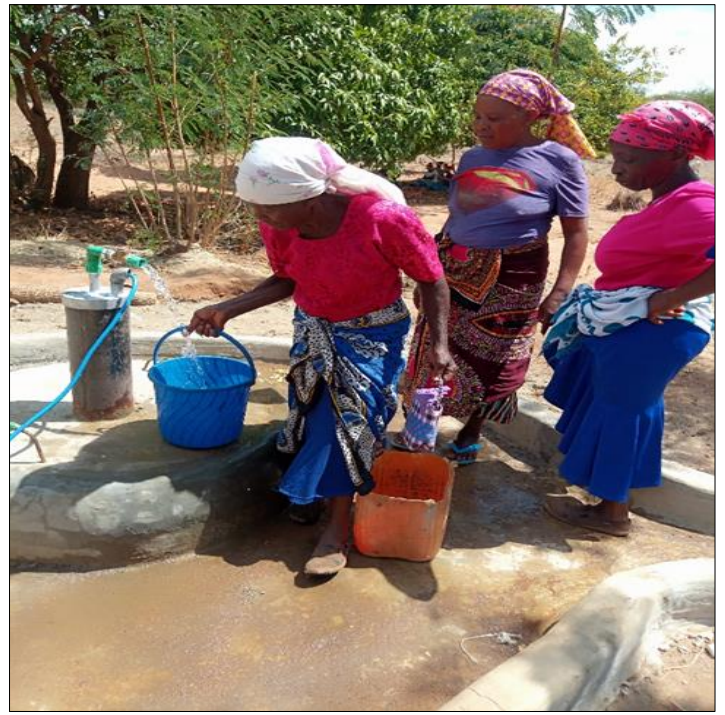
b) Solar pump installation at Wikyato Water point