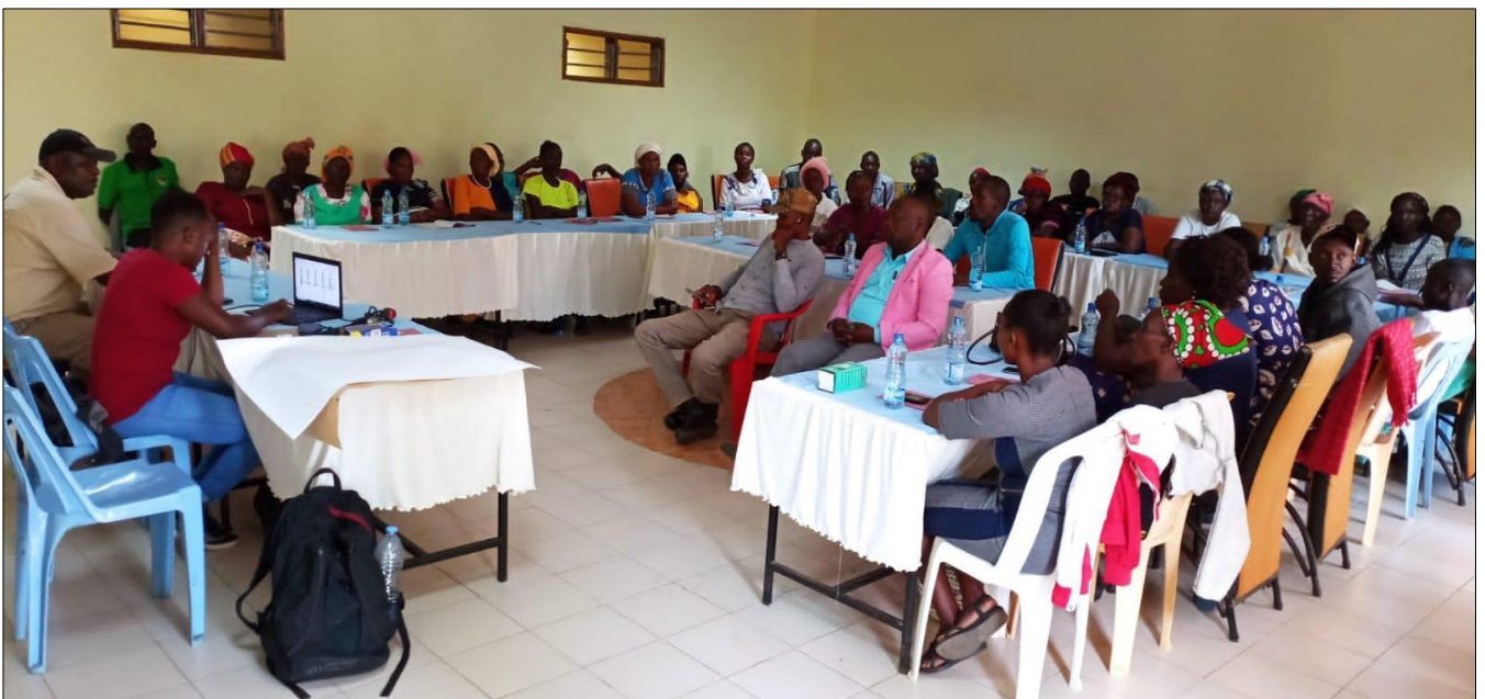
2.0 Quarterly review meeting for Participatory Monitoring process for Project Implementation review for Kibwezi West Ward