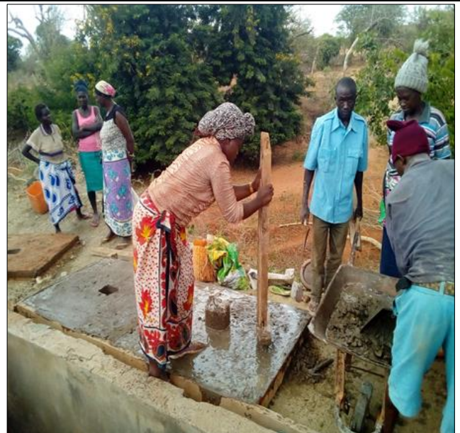
d) Women manufacturing SANPLAT Slabs