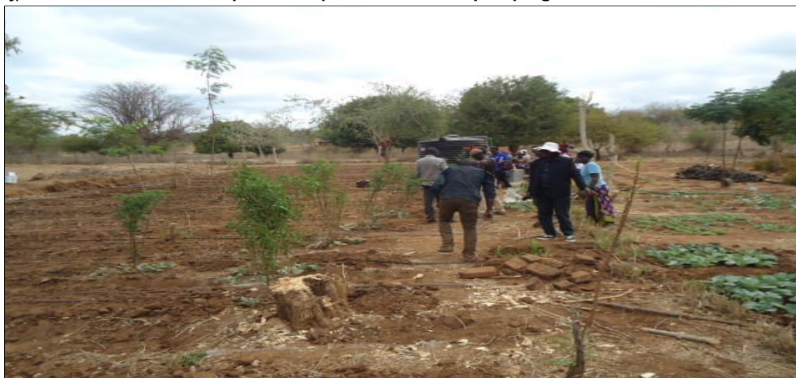
k). Installation of drip irrigation system and kit at Wikwatu mbaitu water point site