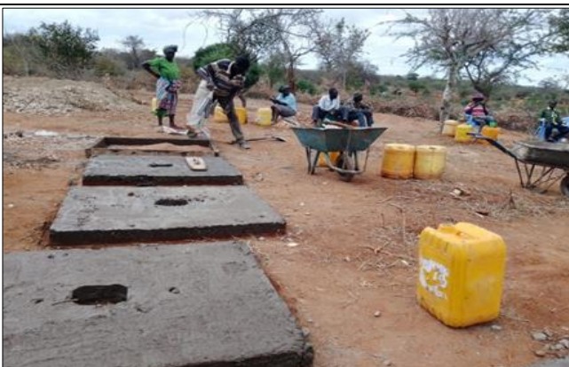
e) Manufactured Slabs ready