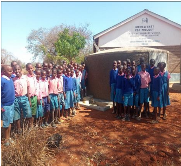
c) Completed Kyumani Pri. School Ferro-cement tank