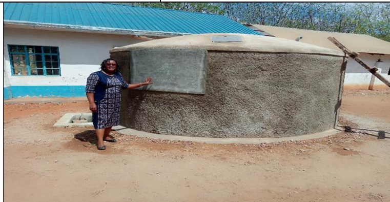
e.) Completed Yikivumbu Pri. School Ferro-cement tank