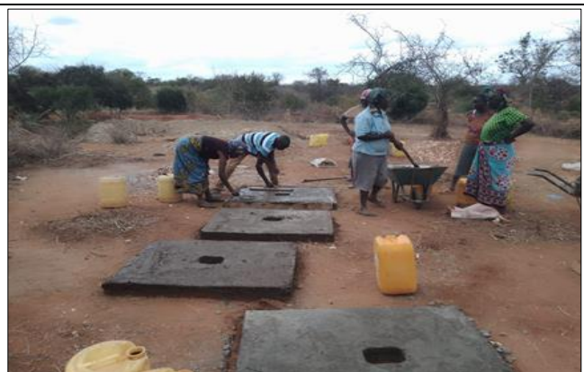
f) SANPLAT Slabs being cured by group members