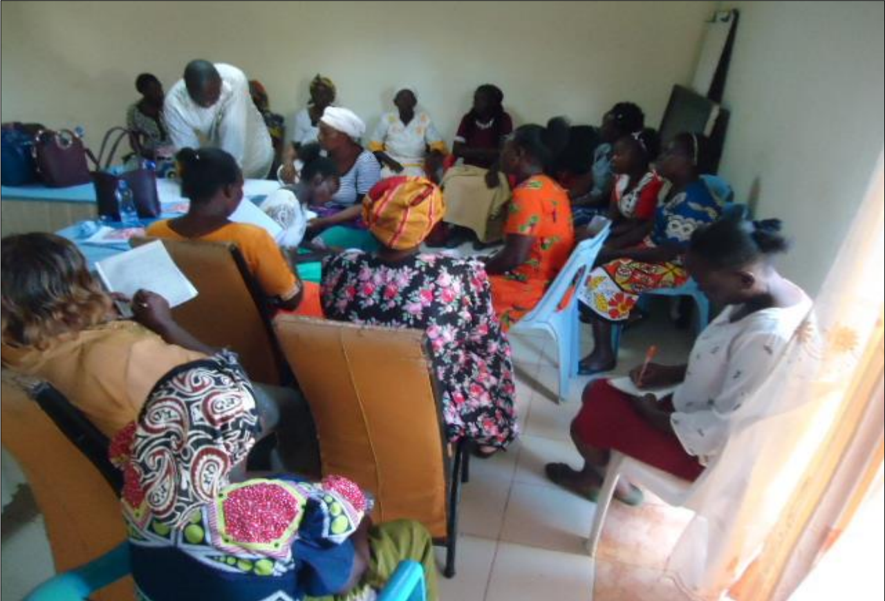
a) Group discussions on operation & maintenance during the training