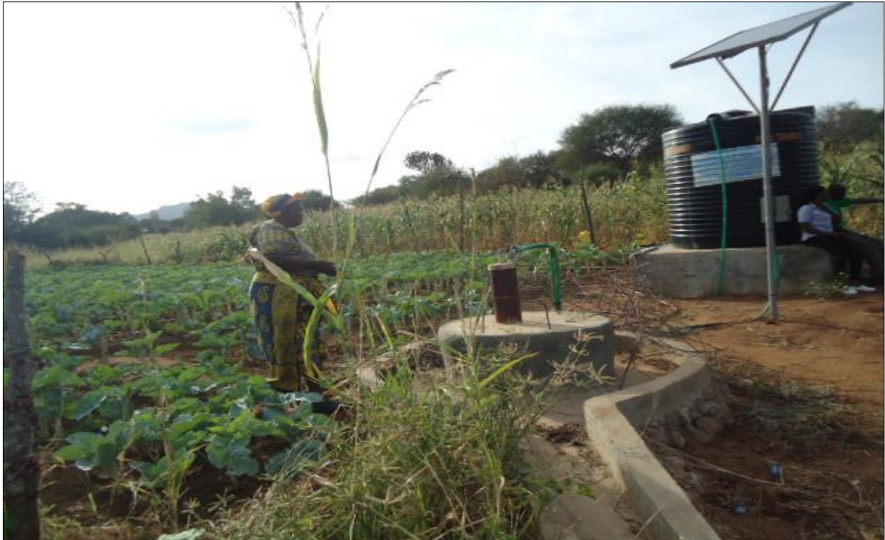
n) Neema ya Mungu water point in Katulani village –Group member checking on their vegetable production farm