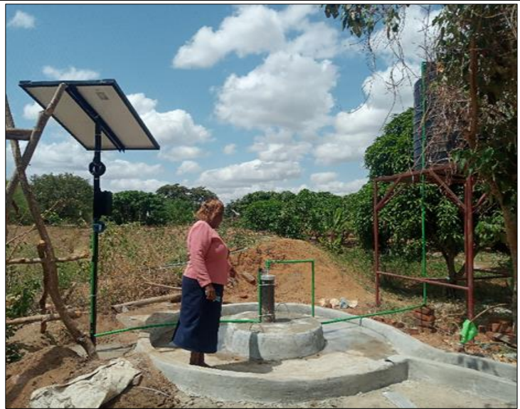
d) Completed Syokoa Water point site with Solar pumping unit