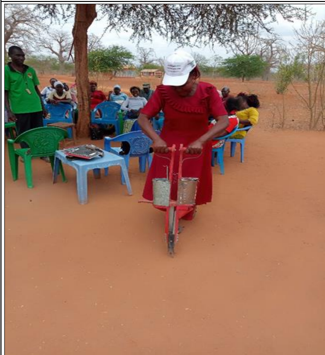
c) Demonstration of a red hand-operated planter for precision seed & fertilizer placement