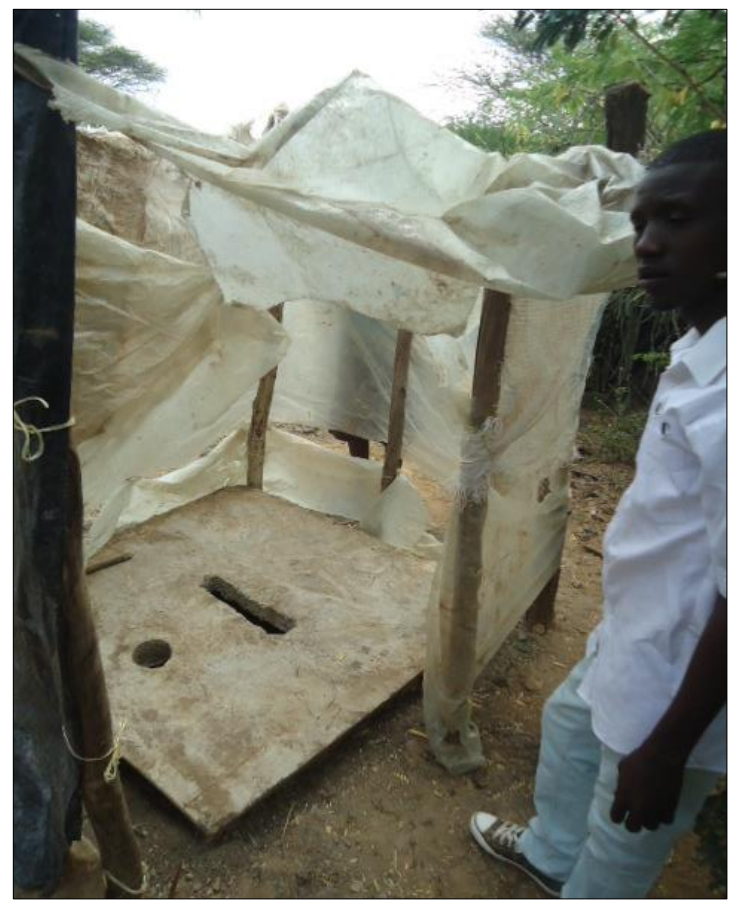
10. Temporary structure household latrine in use with SANPLAT slab in Kabikok village