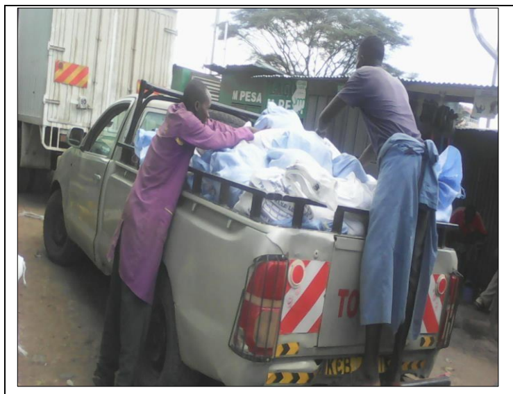
1.Getting the food stuffs from supplier in Marigat