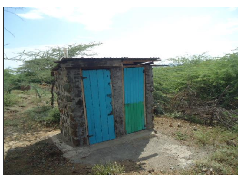
12. Completed household latrine for vulnerable displaced households in Moinini village