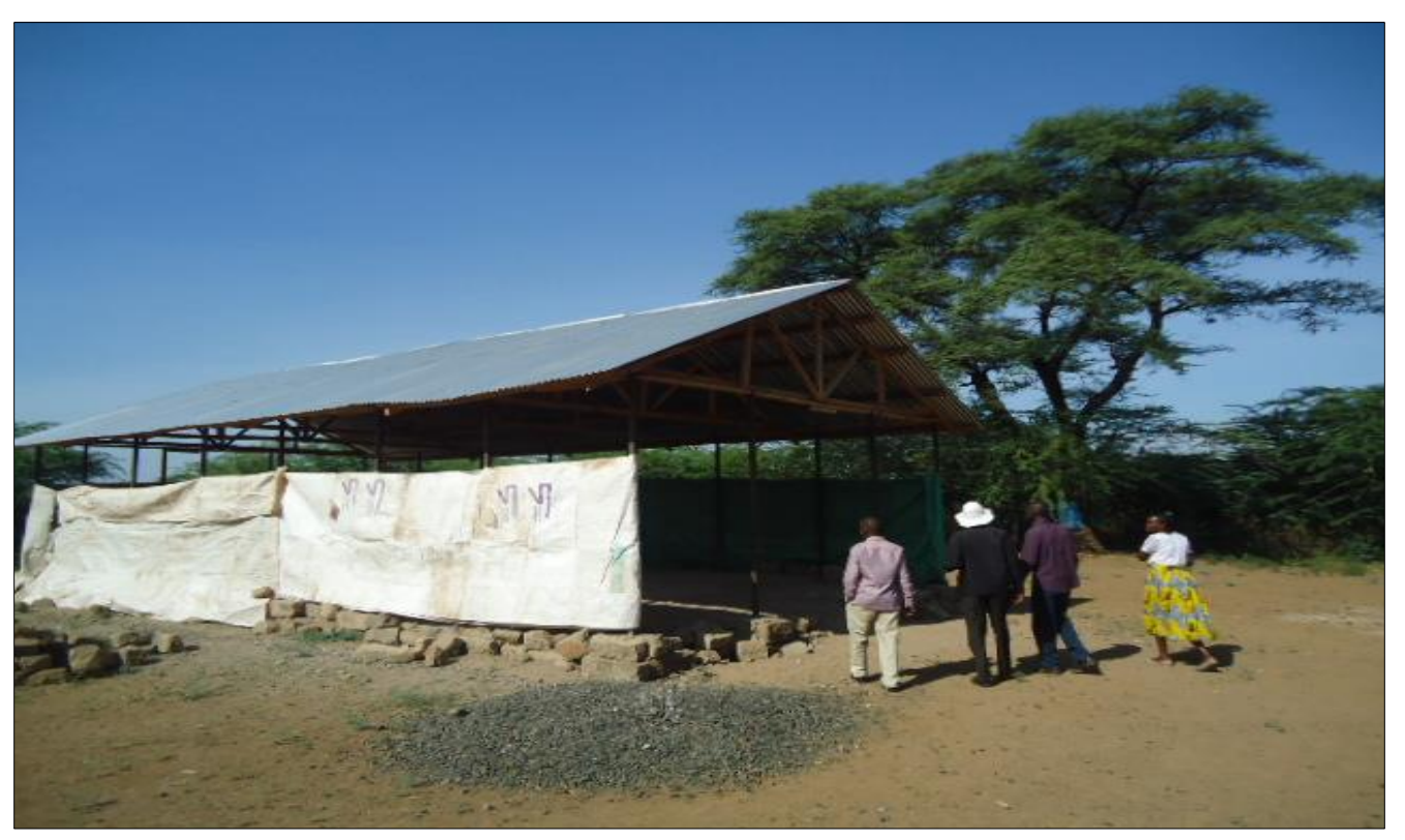
5. Eldume ECD School after reconstruction