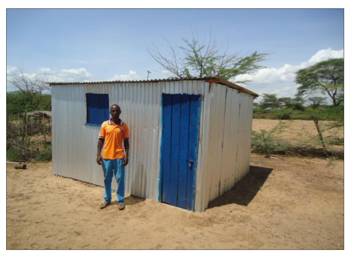
13. Vulnerable household Meshack Lebene who relocated due to floods next to his reconstructed house with support of the project