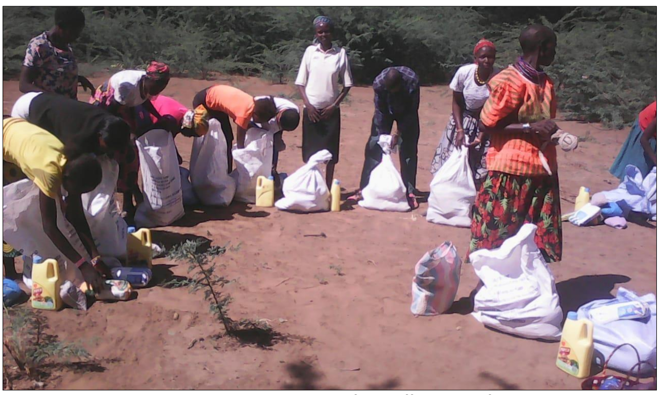
10. Vulnerable displaced households packing their foodstuffs received from the project