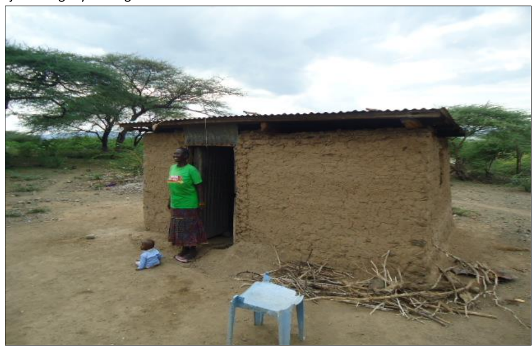
8. A vulnerable womanMs. Grace Chelimo household in house reconstructed with project support in Ngenyin village