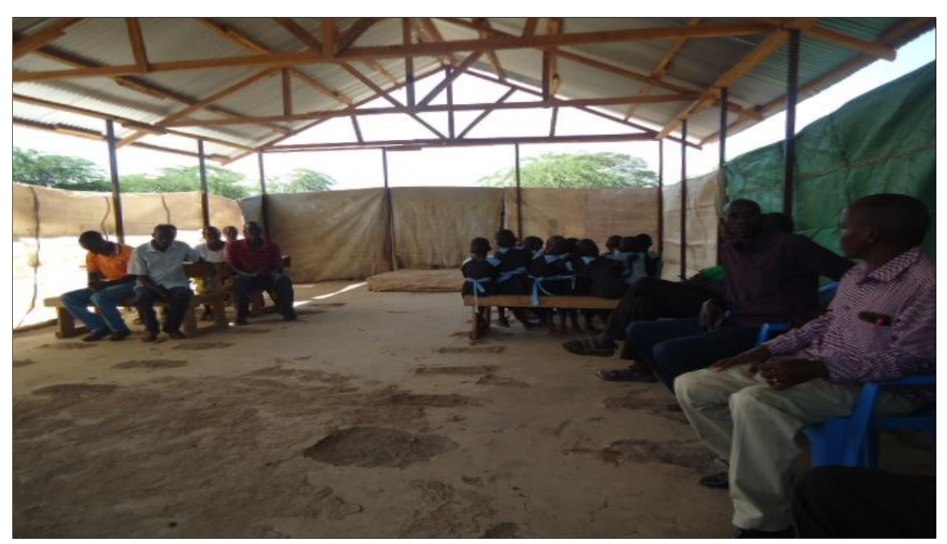
6. Eldume ECD School classroom in use