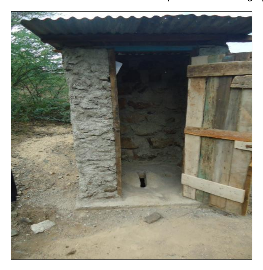
9. Completed latrine and in use in Ngenyim village for displaced vulnerable household