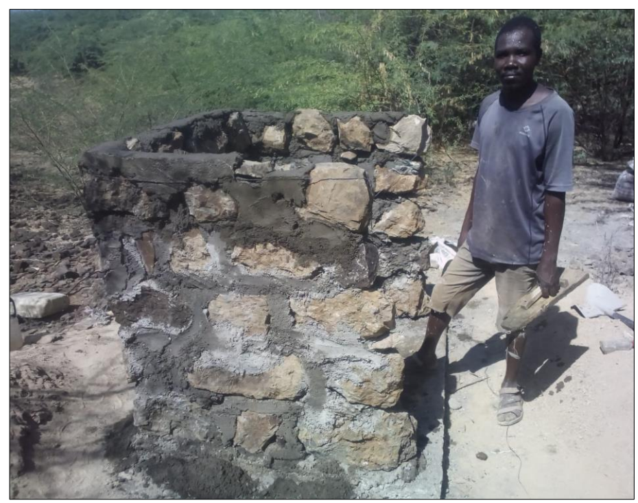
8 Household latrine construction for vulnerable displaced household in Ngenyim village