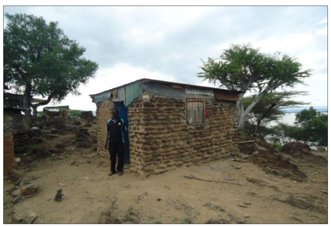
7. Vulnerable household Pius Chelimo accessing a reconstructed house supported by the project in Ngenyin village