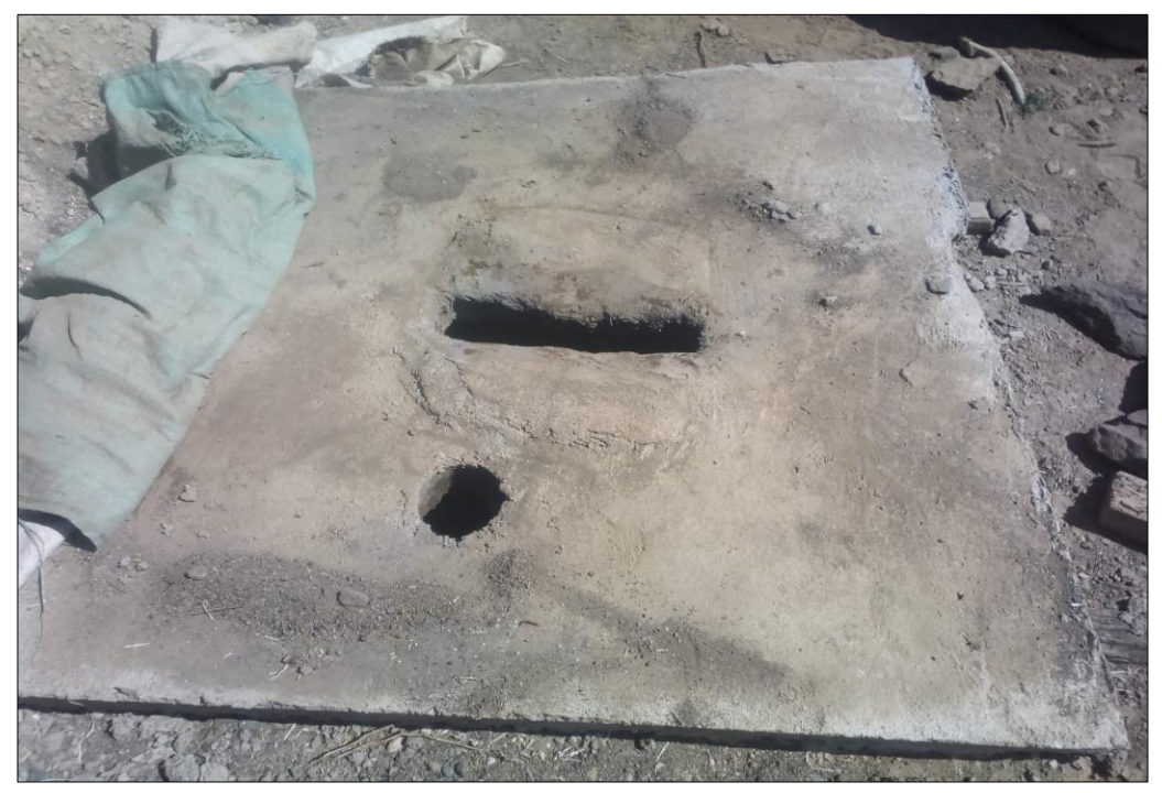
7. Rectangular SANPLAT latrine slab ready for household latrine construction

6. Preparing circular SANPLAT slabs & taking measurements for household latrine construction