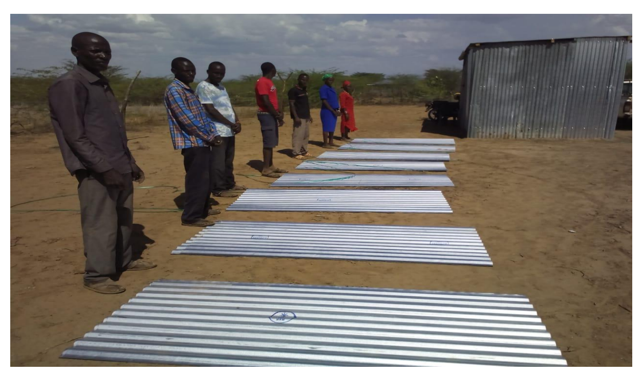
3. Villagers in Salabani village displaced by the floods receiving hardware materials for house construction