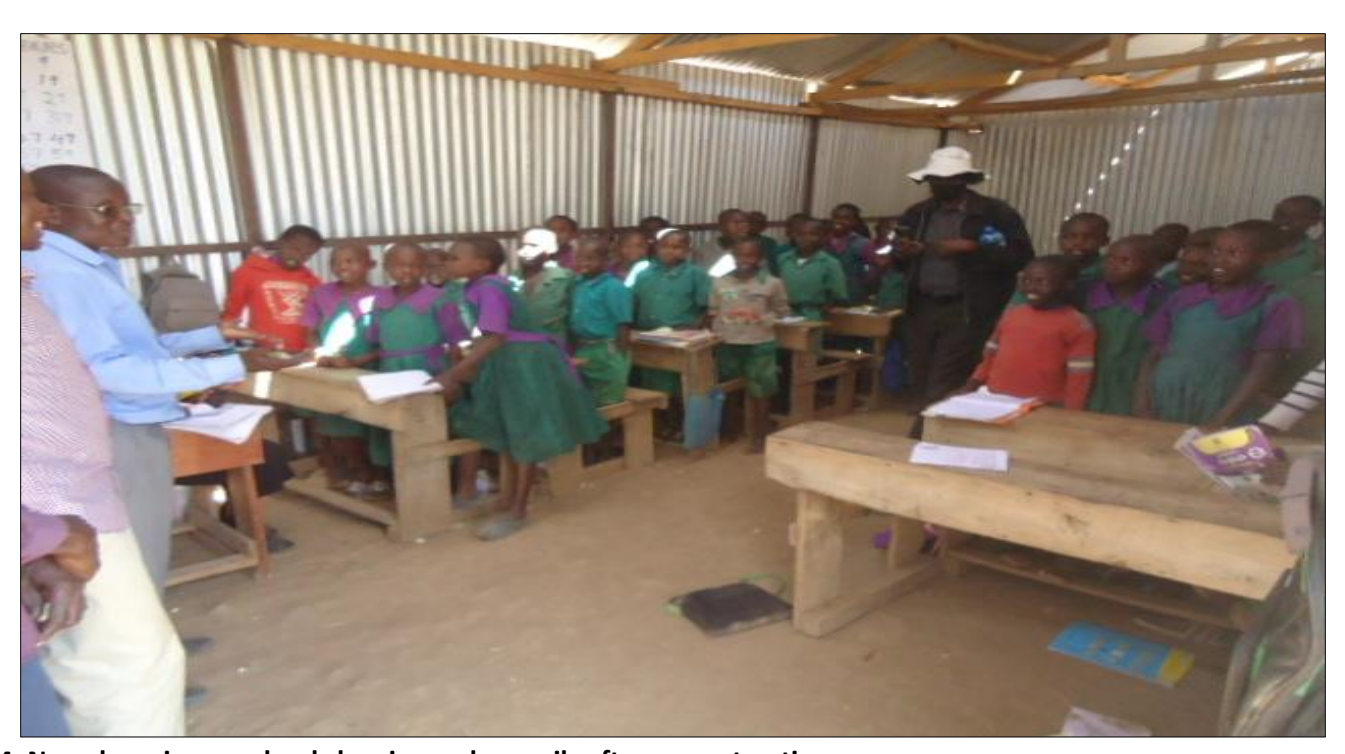
4. Ngambo primary school class in-use by pupils after reconstruction