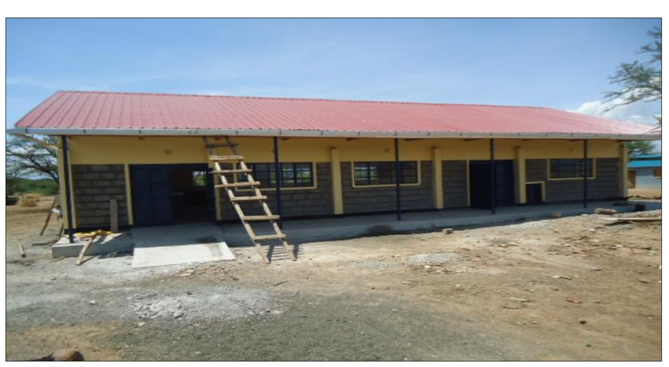
2. Ngambo Girls School laboratory being completed –Reconstruction supported by the project after relocation