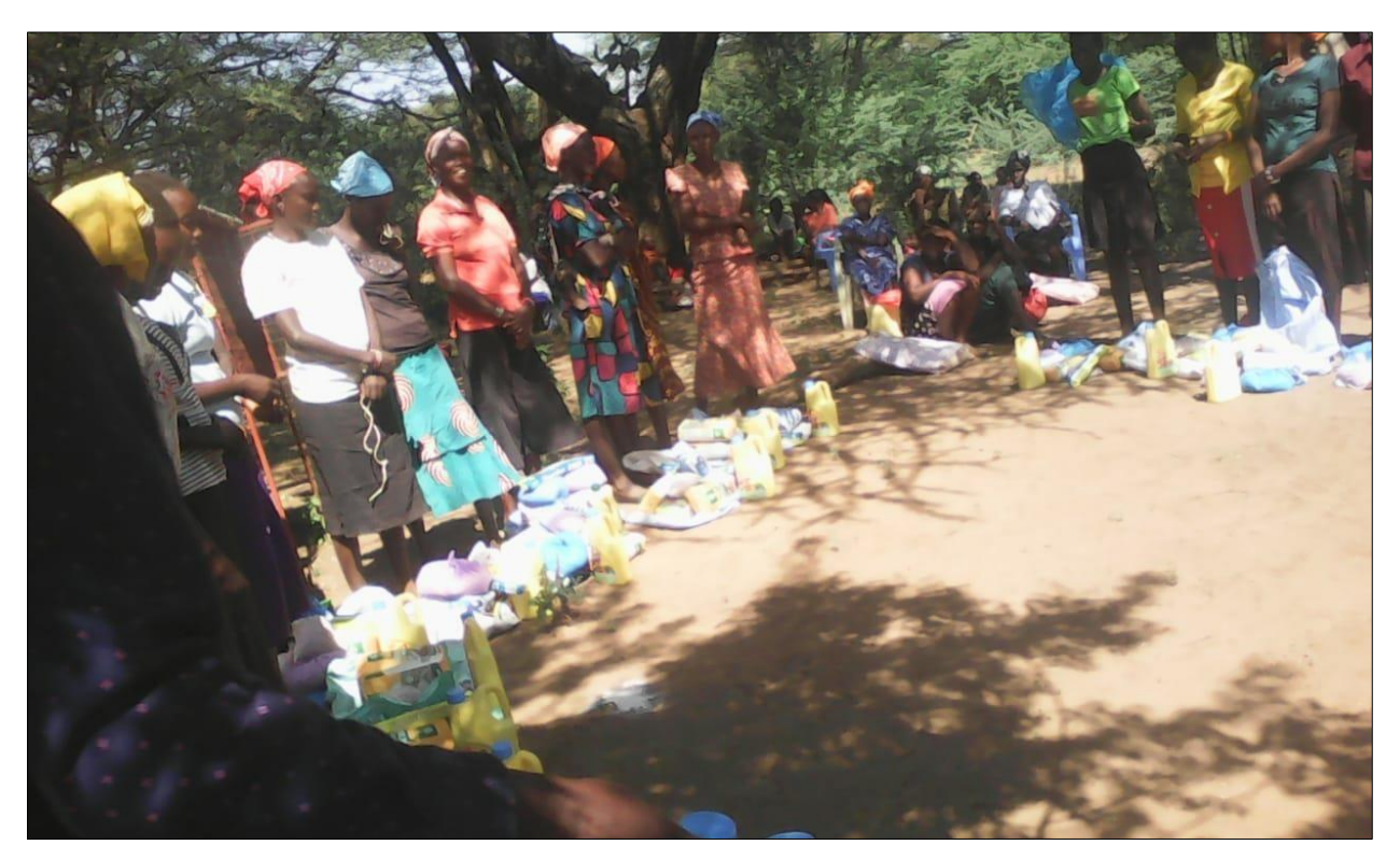
7. Vulnerable displaced households receiving food stuff from the project in Salabani village close to Lake Baringo