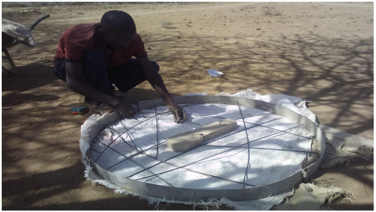
1. SANPLAT Latrine slab being constructed for improved sanitation in relocated village for vulnerable villagers displaced by Lake Baringo floods