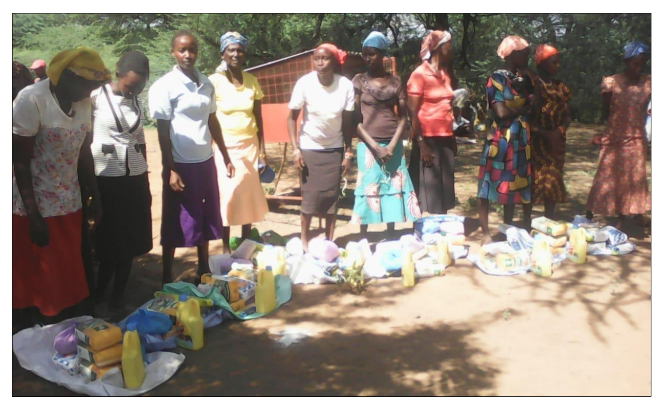
9. Vulnerable displaced households displaying food stuff received from the project