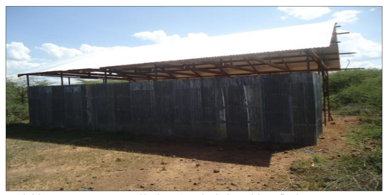
8. Chelelyo ECD Center reconstructed by the Project school relocated due to floods