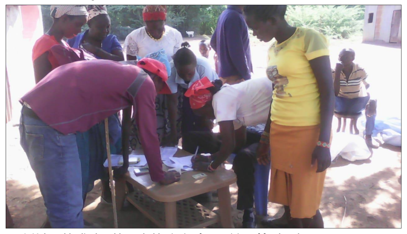
12. Vulnerable displaced households signing for provision of food packages