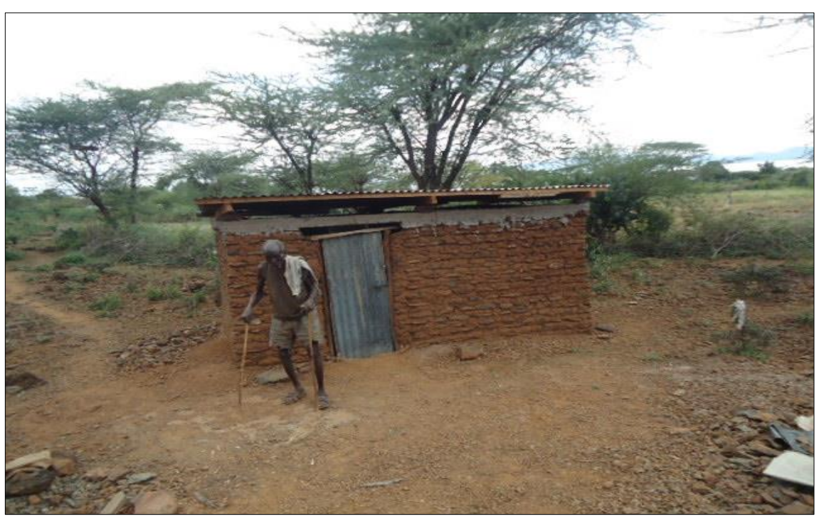
6. Vulnerable elderly man Chemuna Kamuren displaced due to floods supported with house reconstruction in Ngenyin village