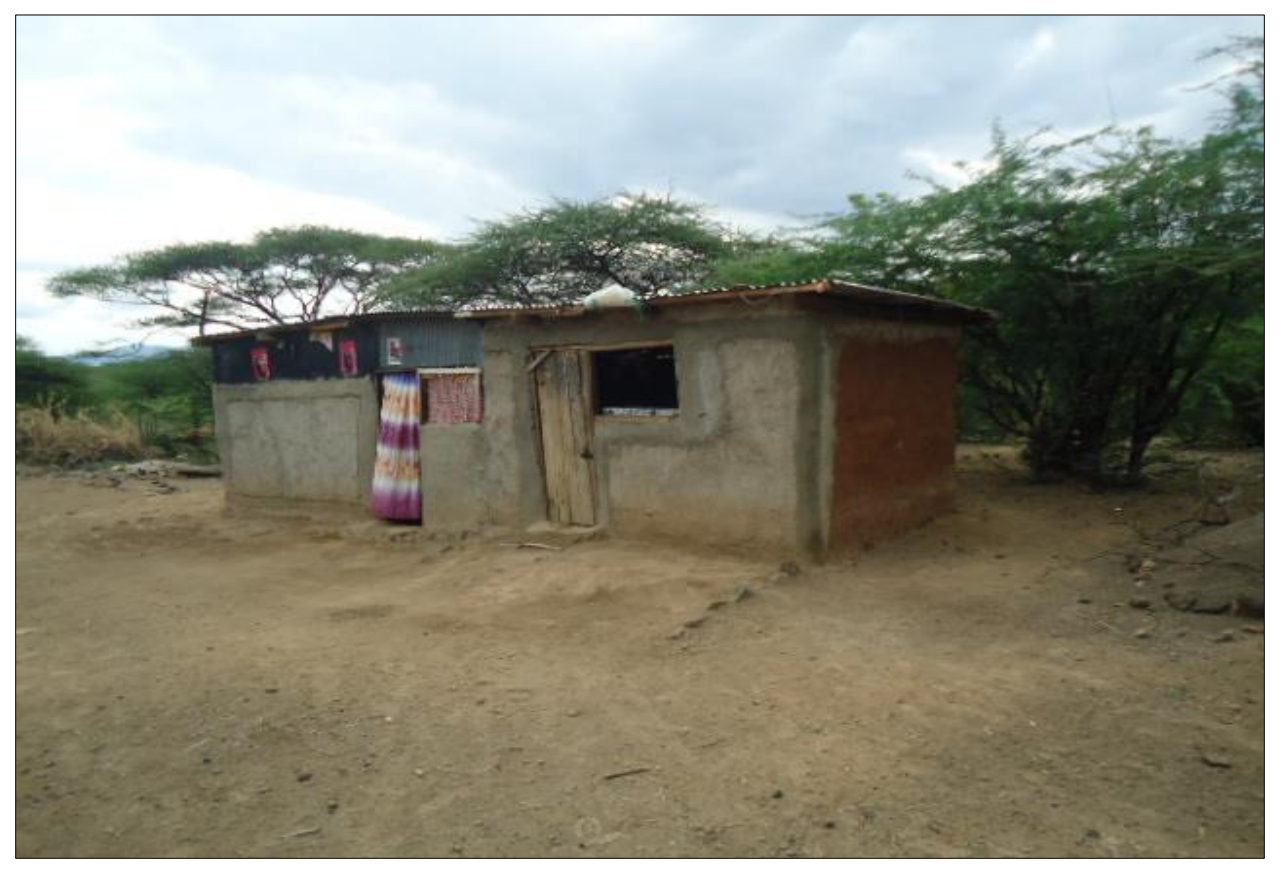
9.A completed reconstructed house with support of the project for vulnerable household in Ngenyin village