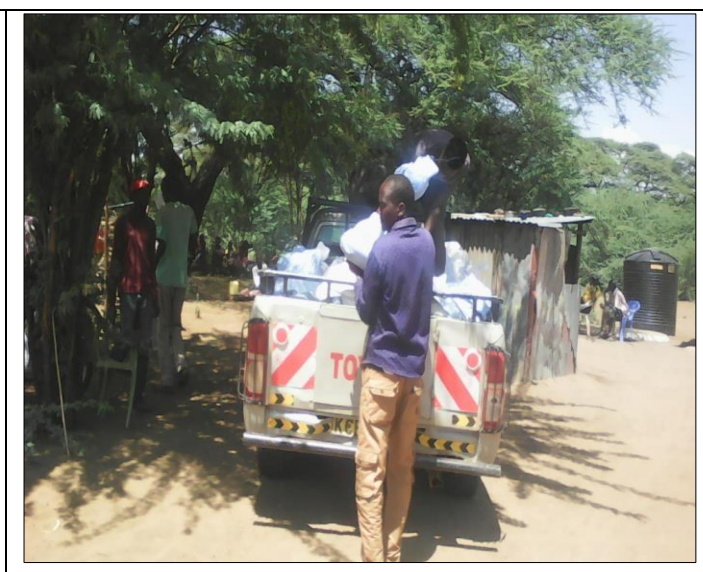
2.Delivering foodstuffs to the target villages