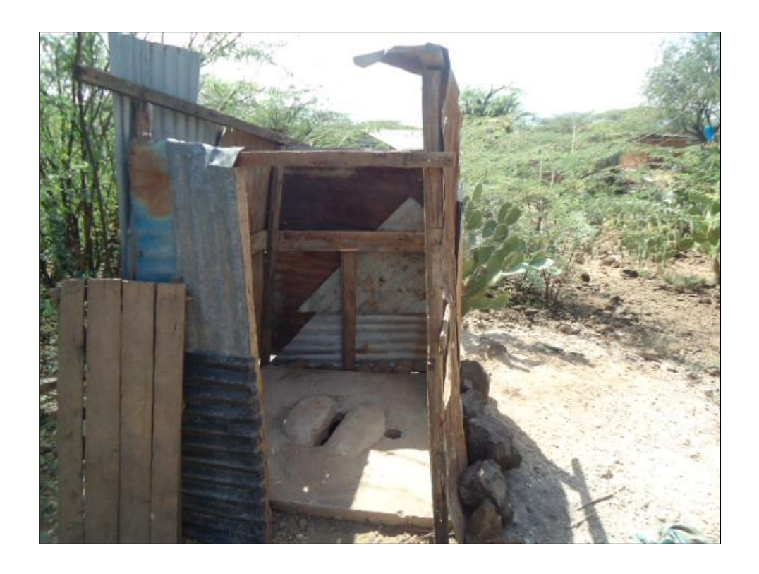
13. Temporary structure household latrine with SANPLAT Slabs in use in Ngenyin village