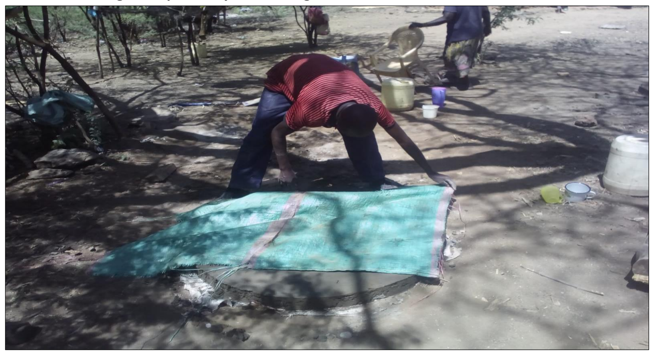
2. SANPLAT Slabs being manufactured for vulnerable community members households for improved sanitation