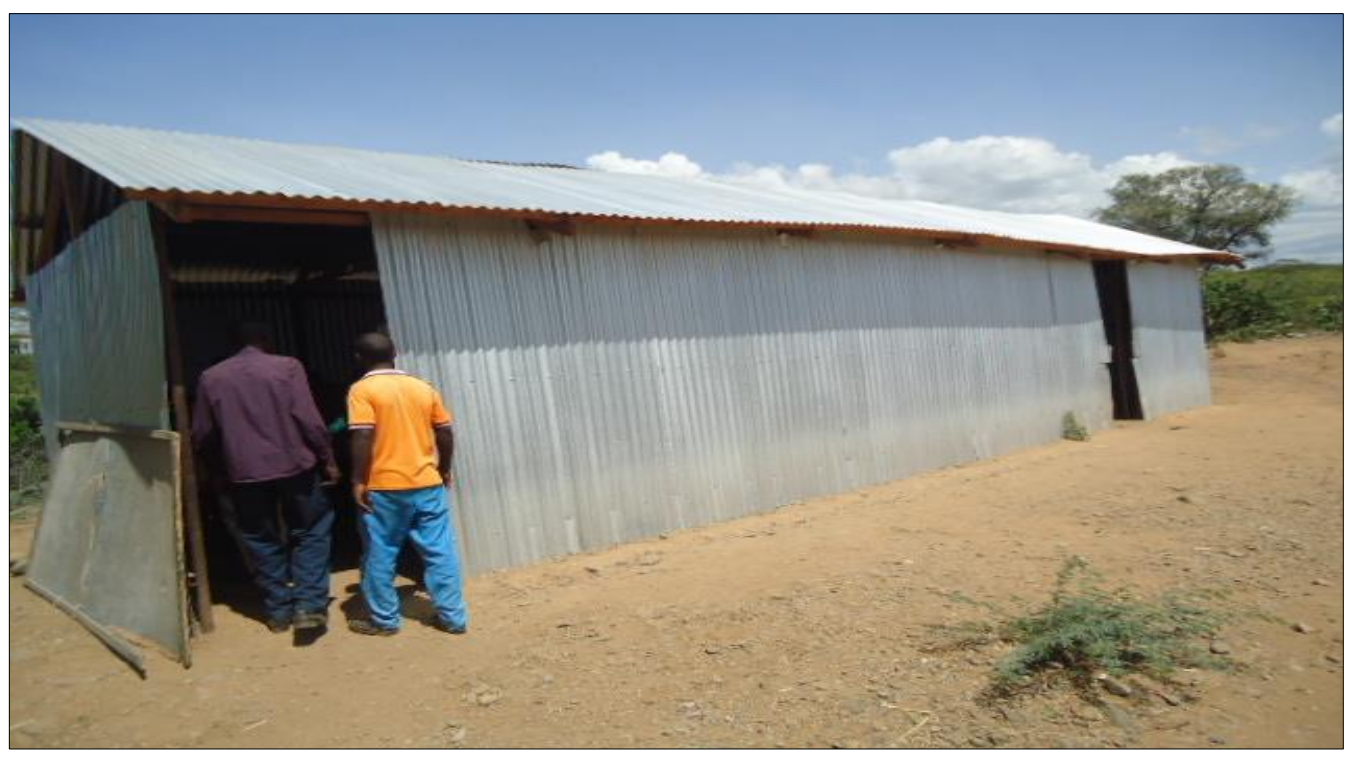
3. Ngambo Primary School classroom reconstructed after school relocation due to Lake Baringo floods