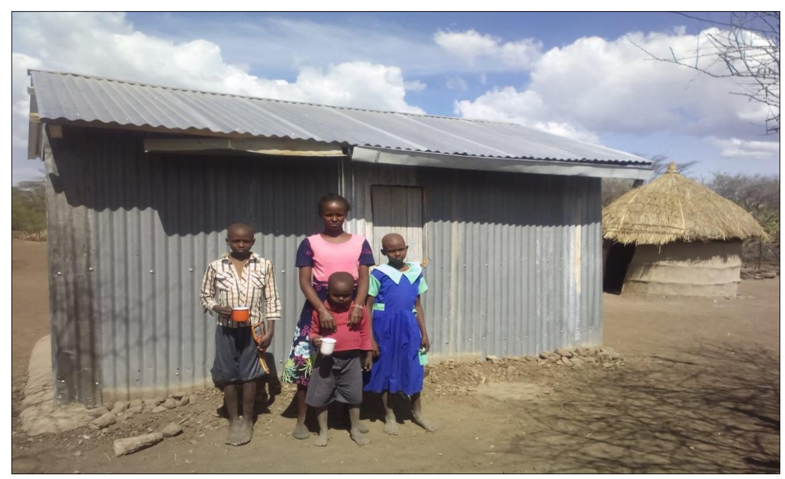
5. A vulnerable household &family affected the floods supported to construct a house in Salabani village