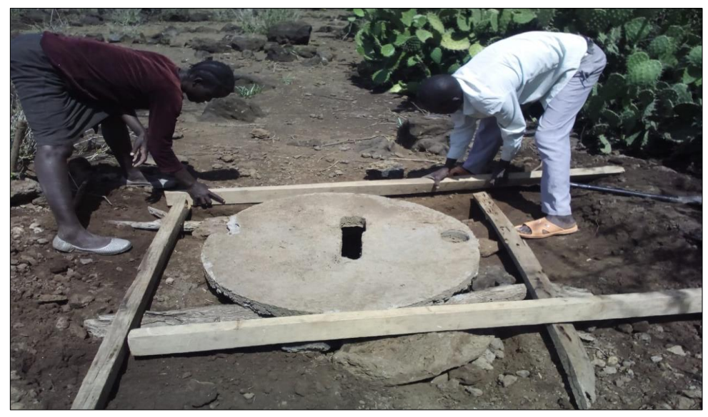
3. Preparing SANPLAT slabs for construction of improved latrines