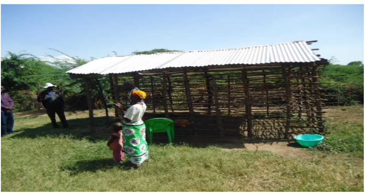
11. A vulnerable household Ms.Grace Lonoo relocated due to floods with their house under construction with support from the project in Lospeken area of Eldume village