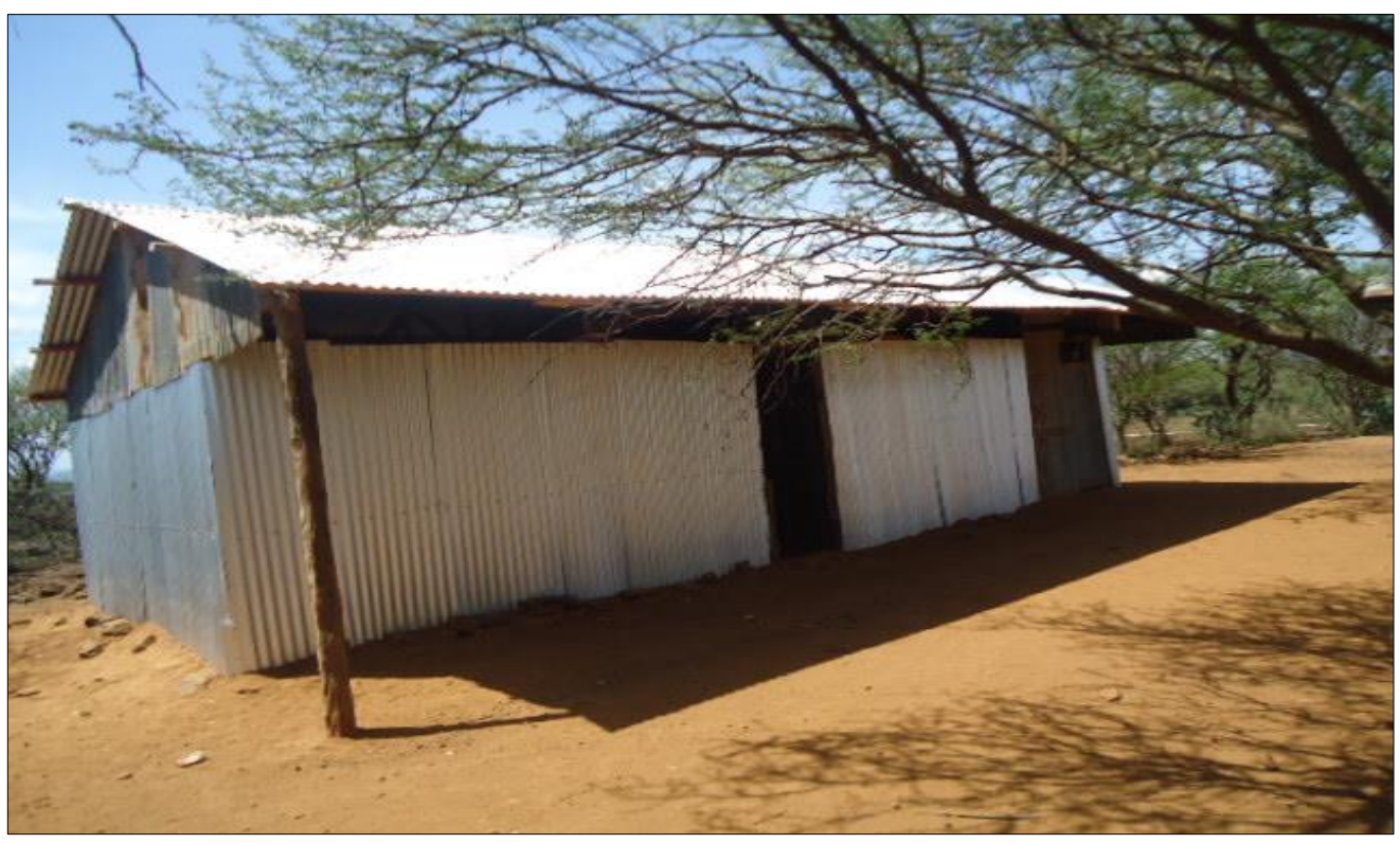
7. Monoinin Primary School ECD Center classroom reconstructed after relocation due to floods