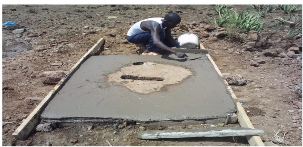
4. Construction of the Households latrines in Salabani village