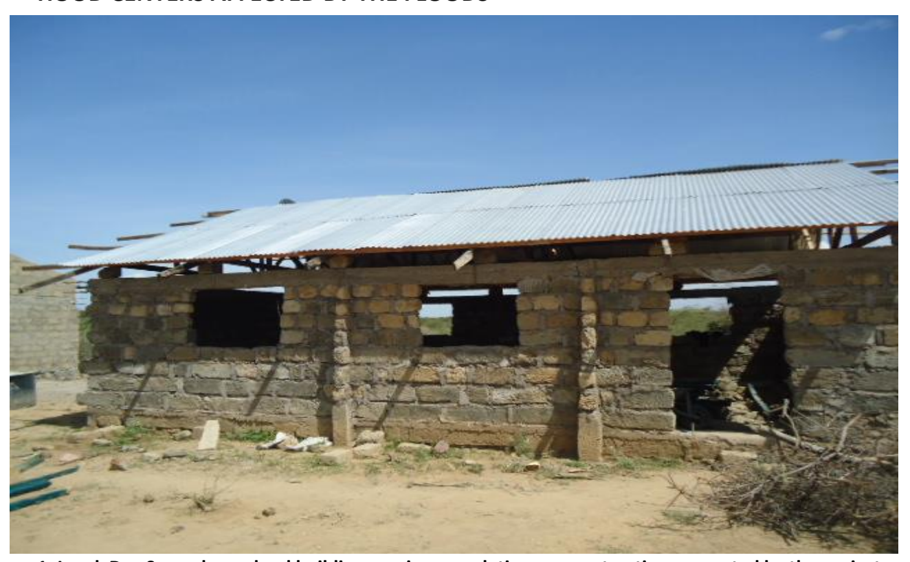
1. Loruk Day Secondary school building nearing completion –reconstruction supported by the project