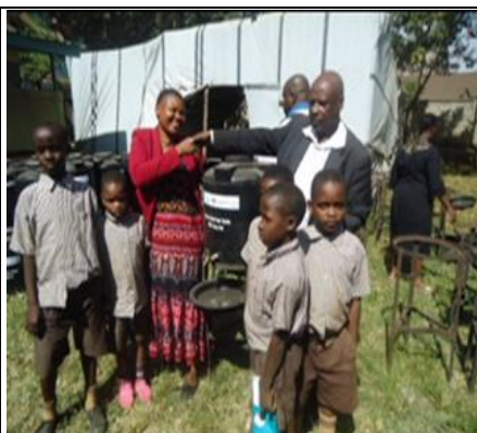
17.KAG ECD receiving hand washing equipment- Starehe subcounty