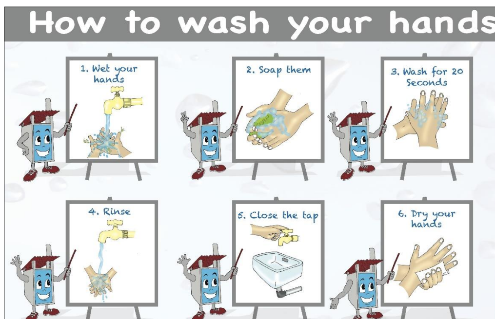
Branding done on the walls of the ECD/Day care centre/next to latrines & on water tanks