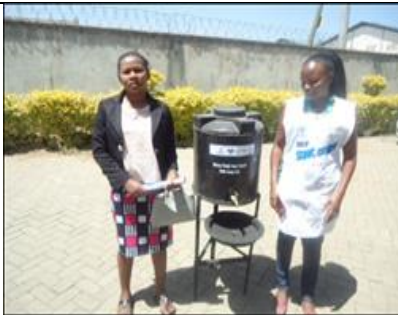
14.PCEA Elite ECD receiving hand washing equipment- Viwandani ward, Makadara