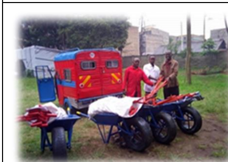
31. Delivery of clean up equipment & tools for Starehe subcounty at Huruma lions health centre