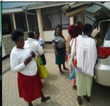
47. CHVs collecting aqua tabs for distribution to target ECD/Day care centre and vulnerable households