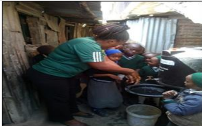
Photo 1-2: CHV Mueni showing Destiny ECD Children effective handwashing procedures-Mabatini ward, Starehe sub county