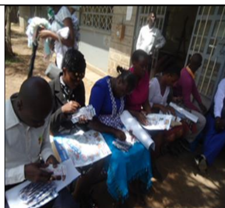
19. ECD/Day care centre teachers receiving aqua tabs & IEC materials- Embakasi subcounty