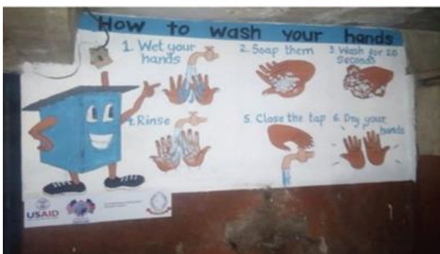
5. Branding of St. James Primary School ECD with Hygiene message & mural