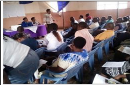
43. Project Orientation forum for Starehe subcounty in October,2018 at Undugu Youth Centre