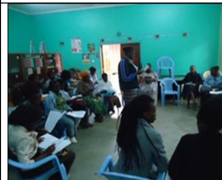
46. Monthly review meeting with CHVs, Public health staff and project staff in July,2019 for Makadara subcounty at Lunga Lunga Health centre