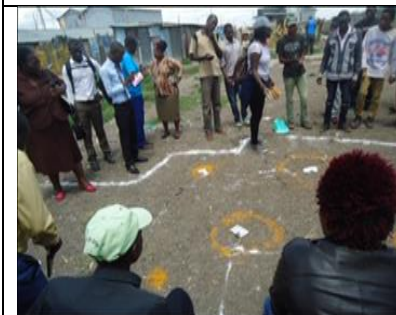
37. Participatory mapping exercise during Urban Community Led Total sanitation in Vietnam village –Njenga ward, Embakasi subcounty