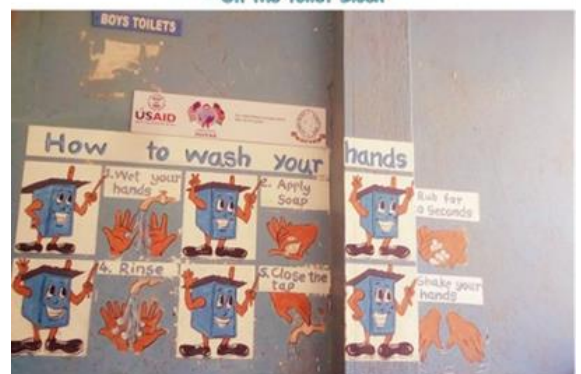
6.Branding of Mission of Hope with Hygiene message & mural