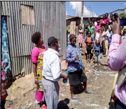
36. Triggering aspects of eating food that is tainted with faeces during urban community led total sanitation in Mathare 3B Village- Starehe subcounty during the