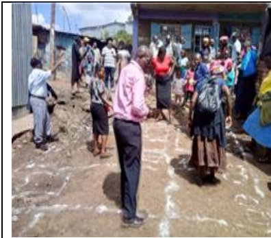
34. Participatory mapping exercise during Urban Community Led Total sanitation in Mathare 3B village-Starehe subcounty