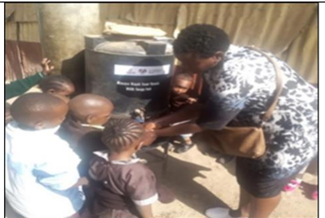
4. CHV Wanza demonstrating effective hand washing with Glorious ECD Children – Mlango Kubwa ward,Starehe subcounty