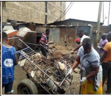
26. Clean up exercise in Thayu village-Mathare no.10-Starehe subcounty