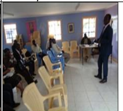
42. Project orientation workshop for Embakasi subcounty at Ruben Health Centre ,October 2018.