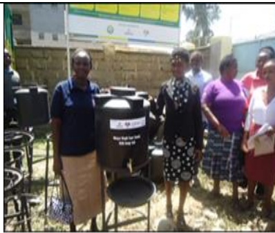
11.Fair Oak ECD receiving handwashing Equipment-Njenga Ward Embakasi subcounty