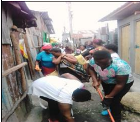
28. Clean up exercise in Jamaica village, Viwandani Ward-Makadara subcounty