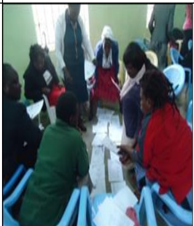
51. CHVs training for Makadara subcounty at Lunga Lunga Health centre – Participants discussing sanitation ladders for sanitation improvements