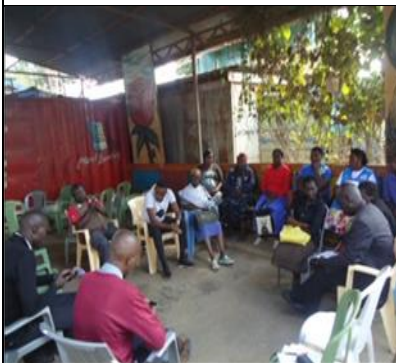
40. Monthly review meeting for Embakasi subcounty at Reuben Health Centre involving project staff, CHVs and Public health staff