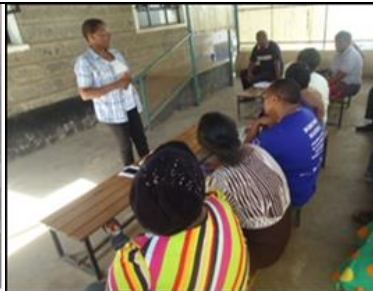
44. Monthly review meeting with CHV, Public health staff and project staff for Starehe subcounty at Huruma Lions Health centre