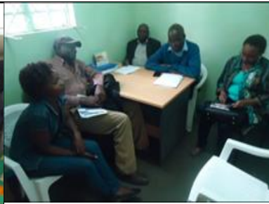
45. WASH coordination meeting to discuss implementation of activities in Feb.2019 for Starehe subcounty at Huruma Lions Health centre