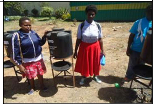
12.Bridge Academy ECD receiving handwashing Equipment-Njenga Ward Embakasi subcounty