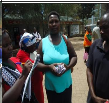
41. CHVs collecting aqua tabs at Mukuru health centre for distribution to vulnerable households and ECD/Day care centres in the project area