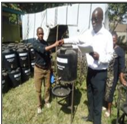
16.SA Community ECD receiving hand washing equipment-Starehe subcounty