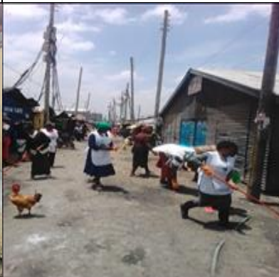
29. Clean up exercise in Jamaica village, Viwandani Ward-Makadara subcounty