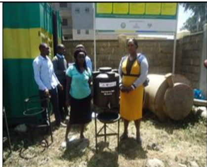
10.Greenhill academy ECD receiving handwashing Equipment-Njenga Ward Embakasi subcounty