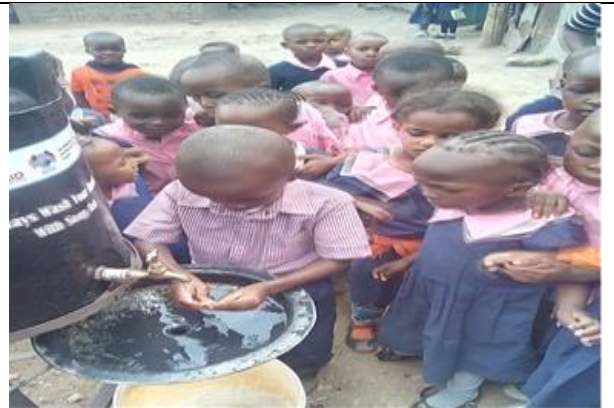
2.ECD Children practicing effective hand washing at Dynamic ECD centre in Makadara sub county