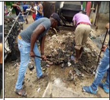
27. Clean up exercise in Thayu village-Mathare no.10-Starehe subcounty