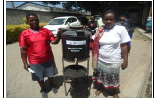
15.St.Elizabeth ECD receiving hand washing equipment- Viwandani ward, Makadara