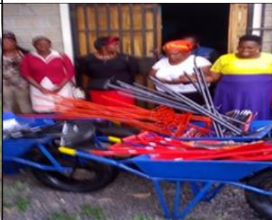
32. Delivery of clean up equipment & tools for Makadara subcounty at Lunga Lunga Health centre