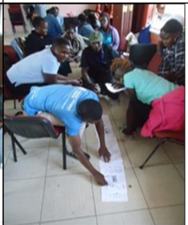
50. CHVs training for Embakasi subcounty at Ruben Health centre-Participants discussing & analysing the sanitation ladders