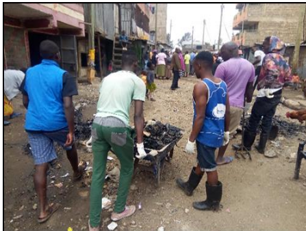
25. Clean up exercise in Thayu village-Mathare no.10-Starehe subcounty