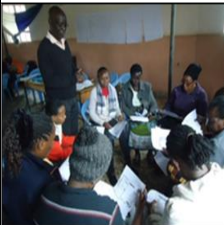
49. CHVs training for Starehe subcounty at Undugu Youth Centre- participants in group discussions