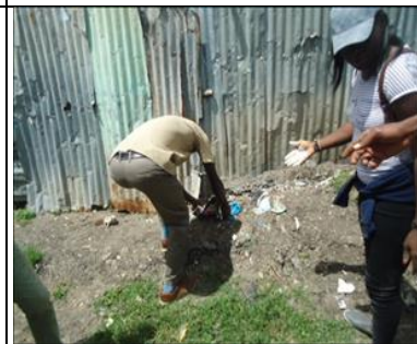
38. Scooping faeces during transect walk profiles to assess sanitation situation in Vietnam village during the urban community led total sanitation exercise