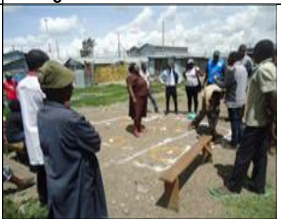
39. Subcounty public health officer discussing with community members during the triggering exercise in Vietnam village - Njenga ward, Embakasi subcounty