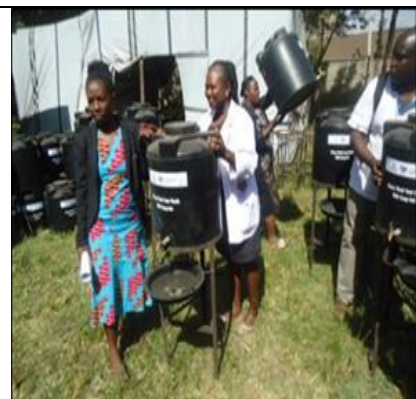
18.Faith ECD receiving hand washing equipment- Starehe subcounty