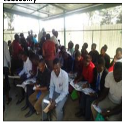
21.ECD/Day care centre teachers receiving aqua tabs & IEC materials- Starehe subcounty