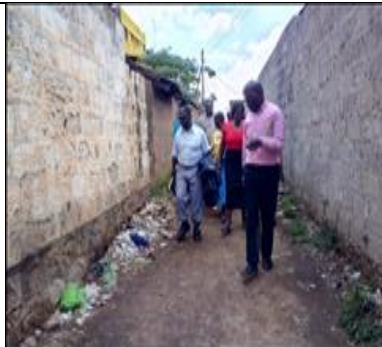
35. Transect walk profiles to assess village sanitation status during urban community led total sanitation in Mathare 3B village- Starehe subcounty