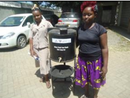
13.Brilliant ECD receiving handwashing Equipment-Viwandani ward, Makadara