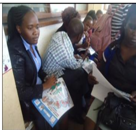
20.ECD/Day care centre teachers receiving aqua tabs & IEC materials- Makadara subcounty