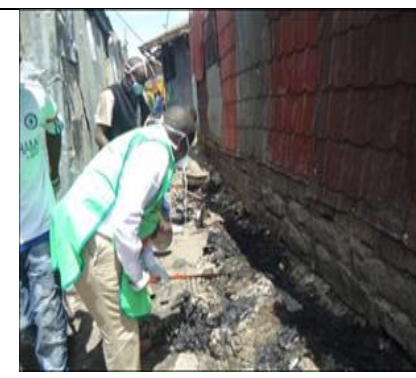
24.. Clean up exercise for Rurii village- Reuben Ward, Embakasi subcounty