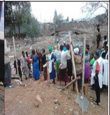
30. Clean up exercise in Jamaica village, Viwandani Ward-Makadara subcounty