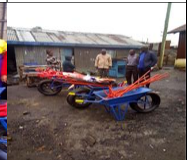
33. Delivery of clean up equipment & tools for Embakasi subcounty